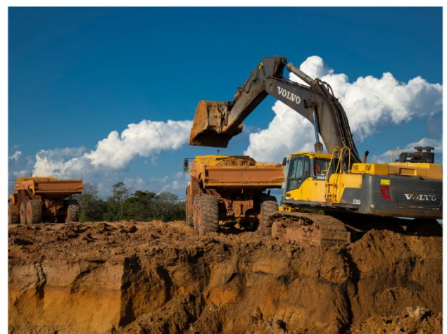
Photos: Lulo team setting up an auger drill rig (left) trial mining during resource definition work (right)