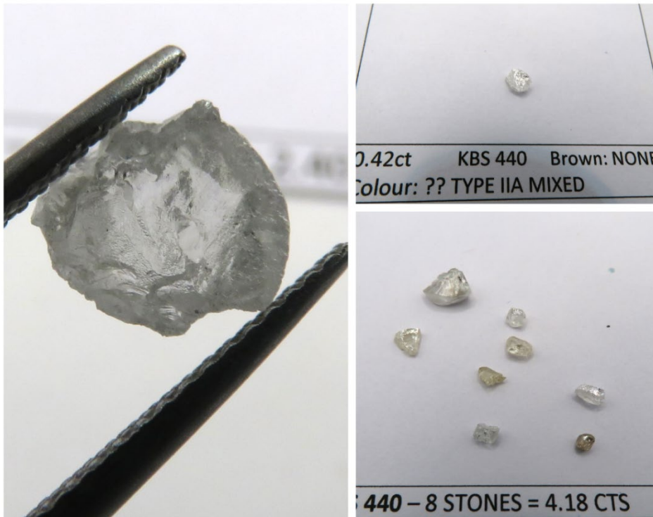
The 2.04 carat diamond recovered from KBS L440 and other diamonds from the same sample.

The best result was from approximately 1,460m 3 of material from Kimberlite L440. The sample recovered 8 diamonds with the largest weighing 2.04 carats.