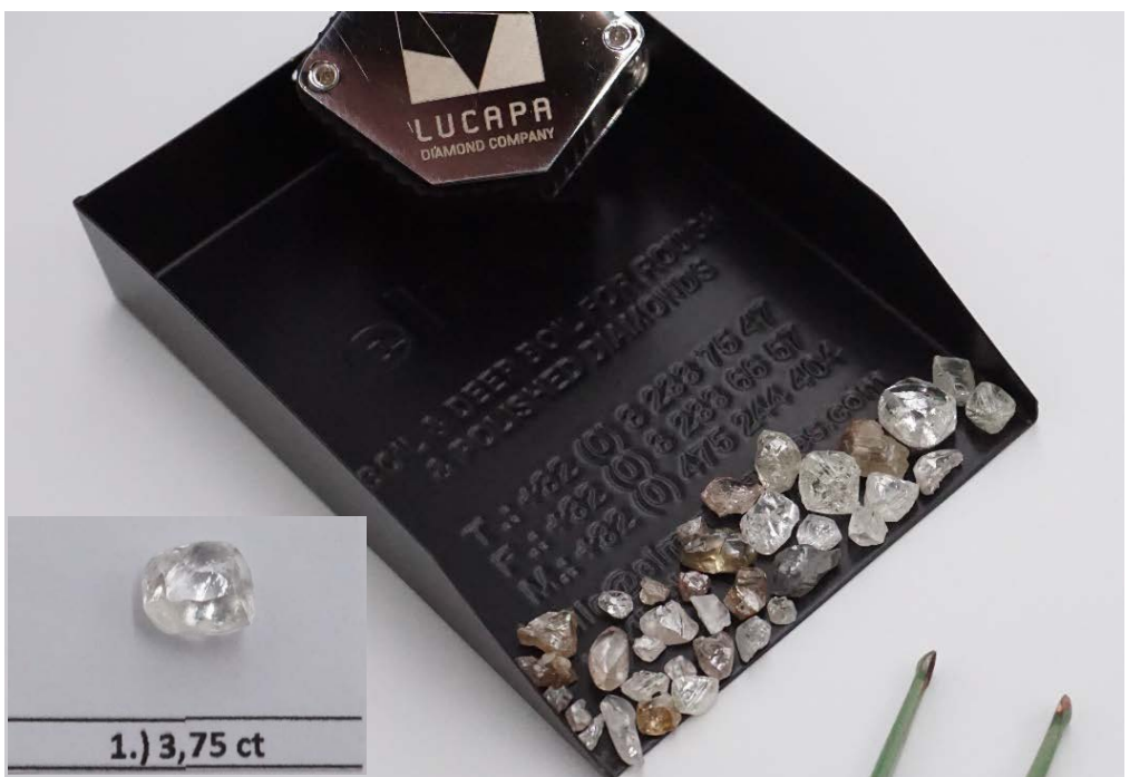
Selection of diamonds recovered from the Canguige tributary in the Lulo kimberlite exploration program Inset: Largest of the 45 diamonds recovered from the Canguige tributary, weighing 3.75 carats

As announced to the ASX on 19 February 2020, the Project Lulo partners recovered 45 diamonds weighing 30.3 carats from a stream bulk sample taken from the Canguige tributary draining into the Cacuilo River valley, where Lucapa and its partners are recovering some of the world's most valuable alluvial diamonds (Figure 1).