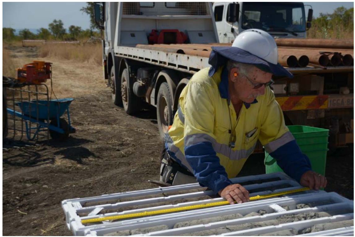
Figure 1: Inspecting the drill core from the first hole drilled at Little Spring Creek in the follow-up program