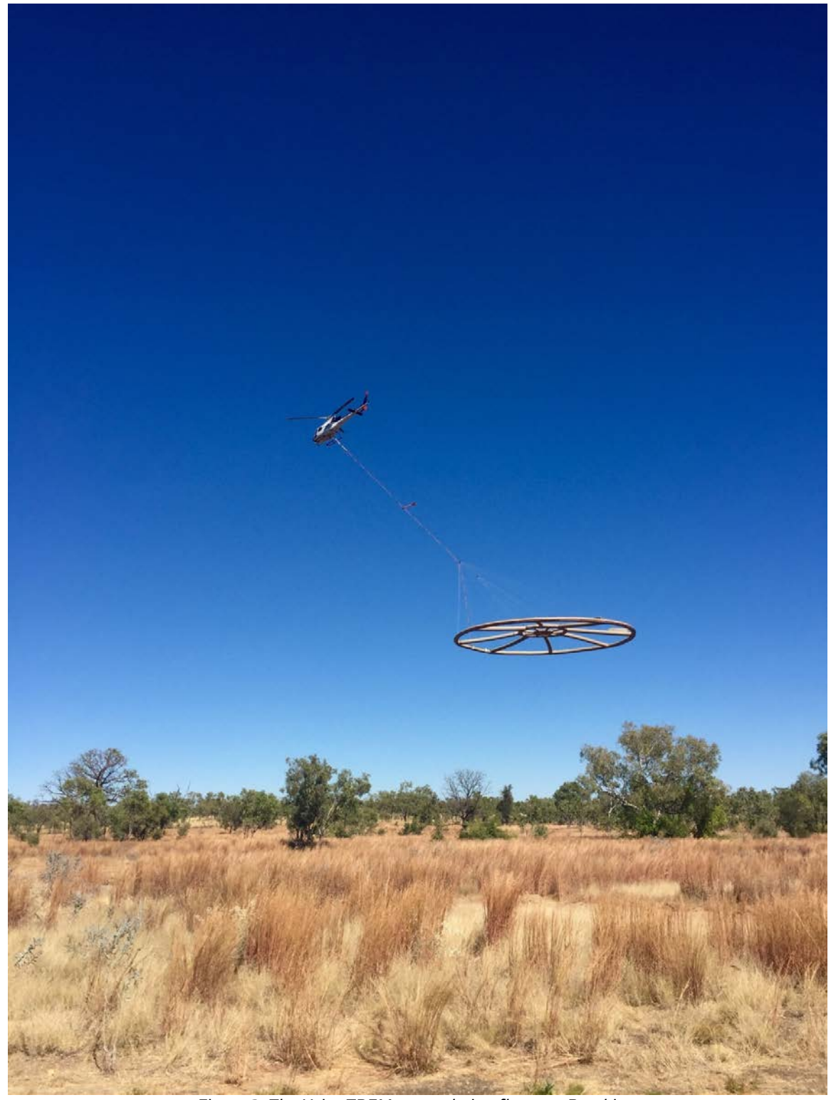
Figure 3: The Xcite TDEM survey being flown at Brooking

NRG has completed flying the Xcite TDEM survey on schedule. The interpretation and modelling of the TDEM survey data is expected to take approximately four weeks to process and Lucapa will announce the results as soon as they come to hand.