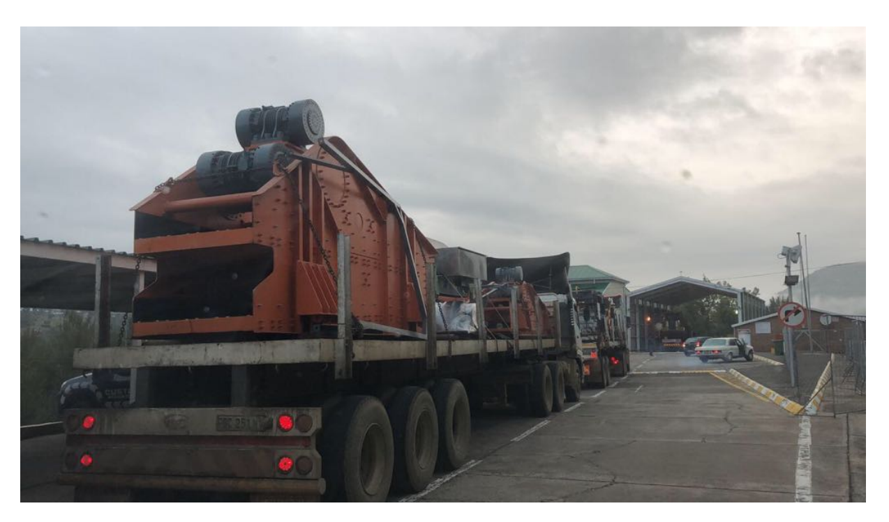
DMS components for the new 150 tph Mothae diamond plant at the Lesotho border