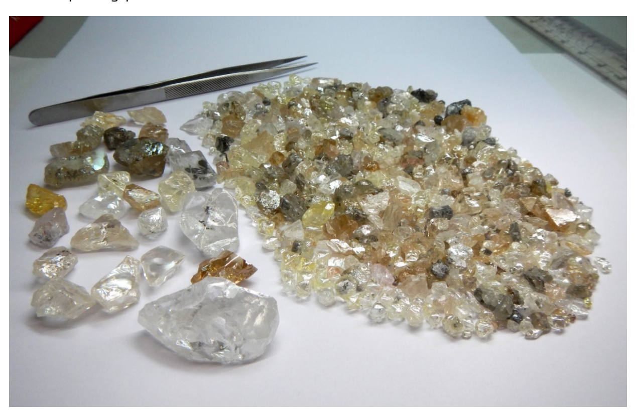
Parcel of Lulo diamonds sold during the Quarter

As at 31 March, SML had cash of US$13.1 million and a diamond inventory of 3,047 carats, up 20% on the corresponding quarter.