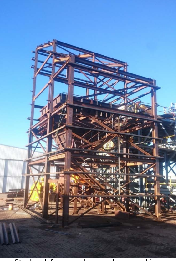
Steelwork for secondary crusher surge bin preassembled prior to transport to site