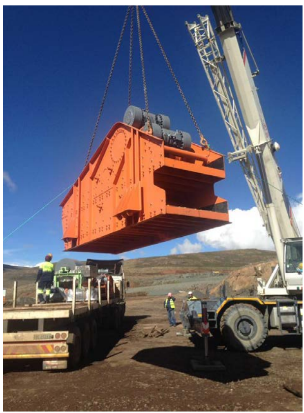
DMS components being offloaded on site at Mothae