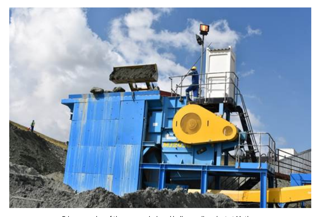
Primary crusher of the re-commissioned bulk sampling plant at Mothae