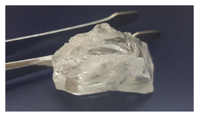
An 85 carat Type IIa D-colour diamond recovered at Lulo during the Quarter

Diamond grade improved 26% to 7.3 carats per 100 cubic metres, though throughput was down by 13%, primarily a result of the extremely heavy rain that fell during this Angolan wet season, which generally finishes in April.