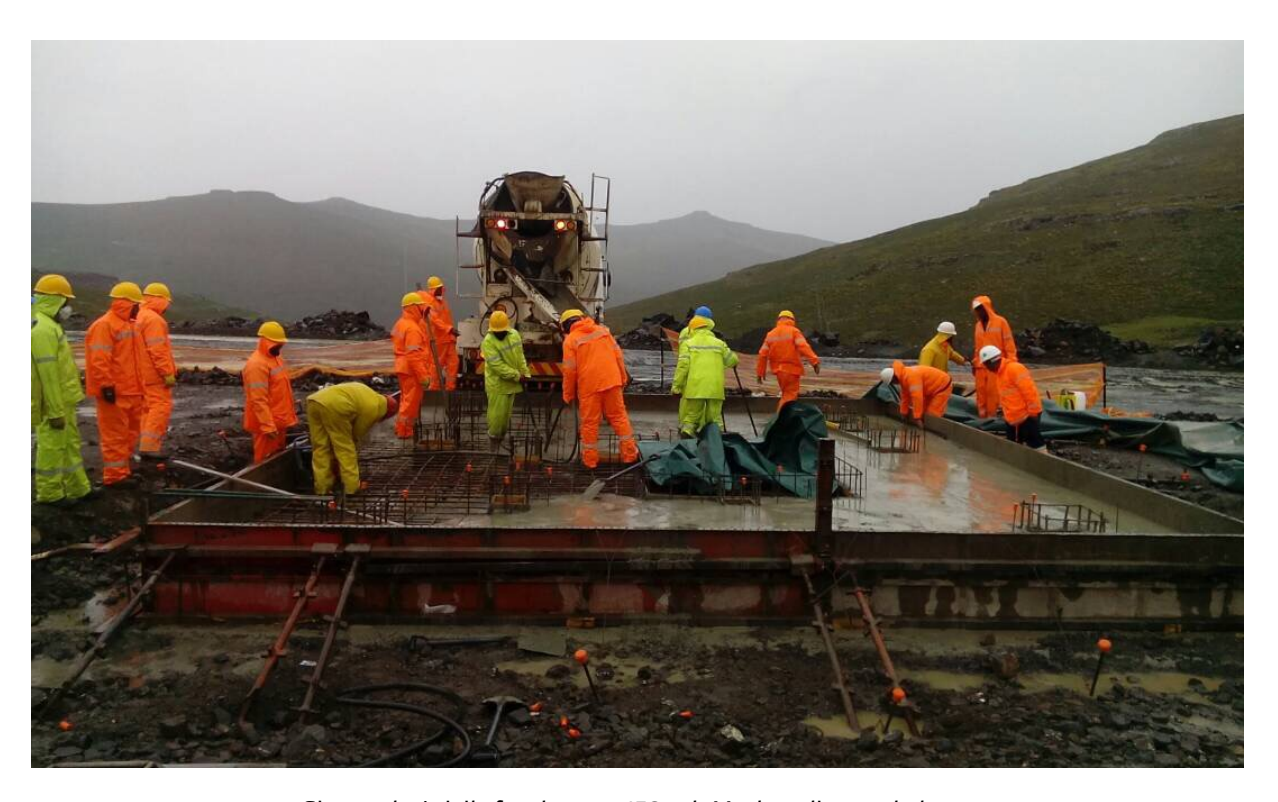
Site works/ civils for the new 150 tph Mothae diamond plant