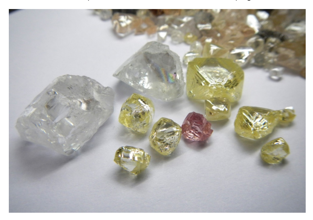
Selection of Lulo alluvial diamonds sold during the Quarter