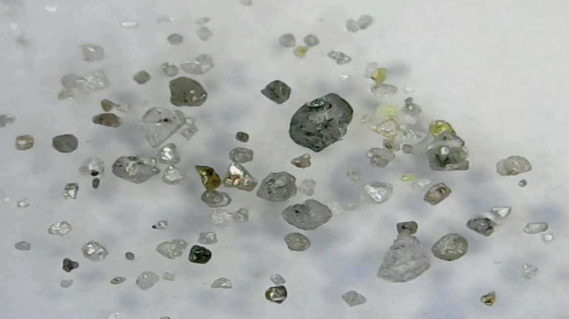
Macro and micro diamonds recovered from Little Spring Creek