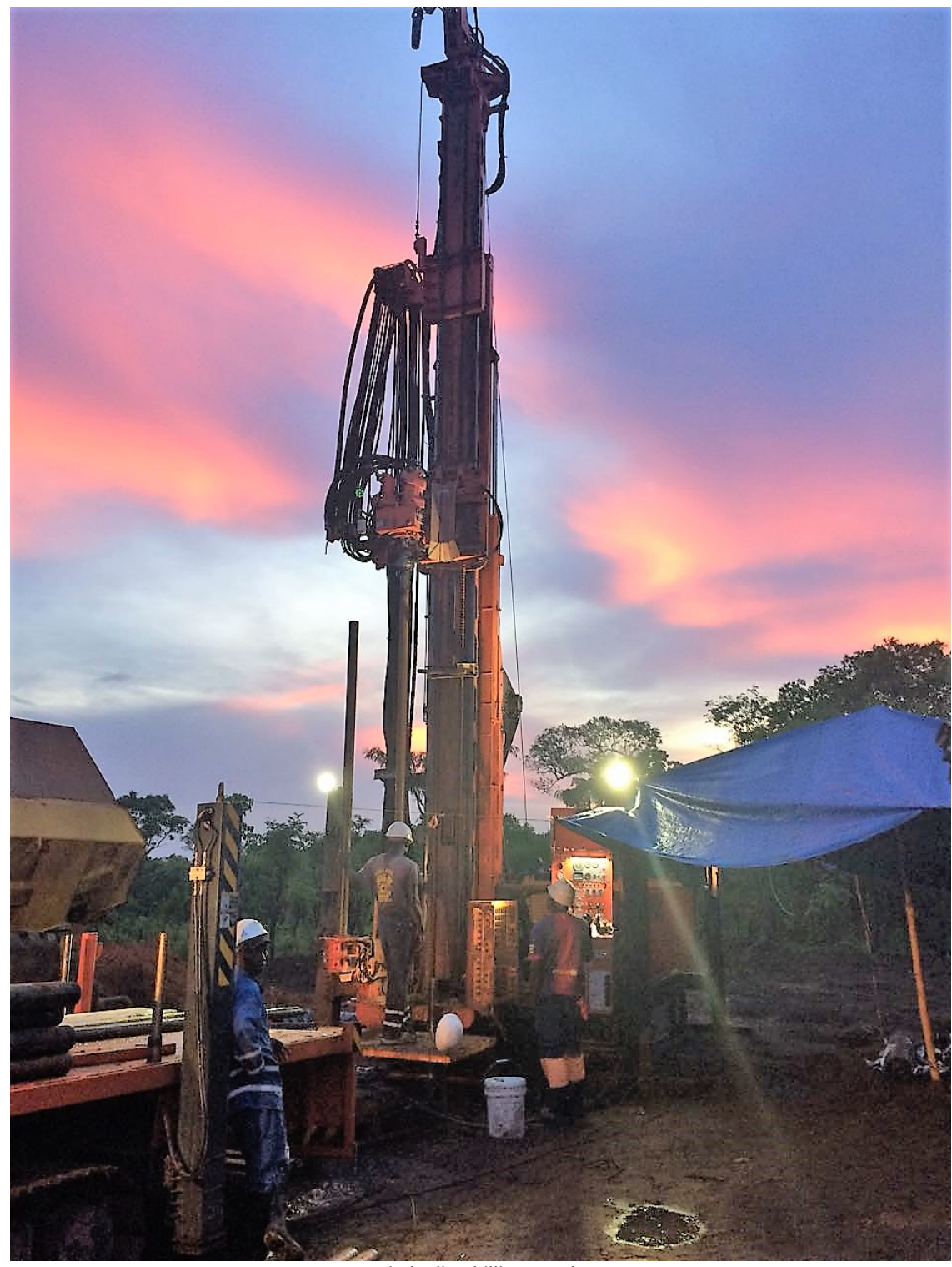
Kimberlite drilling at Lulo

Next batch of core from 10 kimberlites sent for laboratory analysis