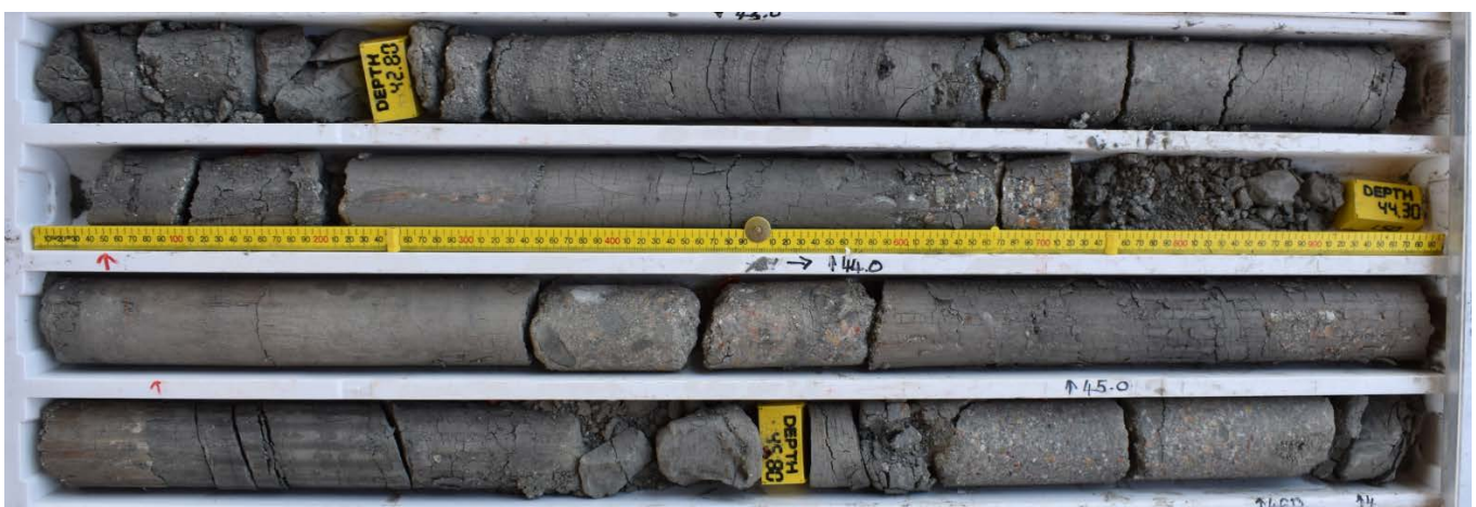
Drill core from Little Spring Creek prospect at Brooking

Brooking is located ~40km of the Ellendale diamond mine which, when in operation, was the world's leading producer of rare fancy yellow diamonds.