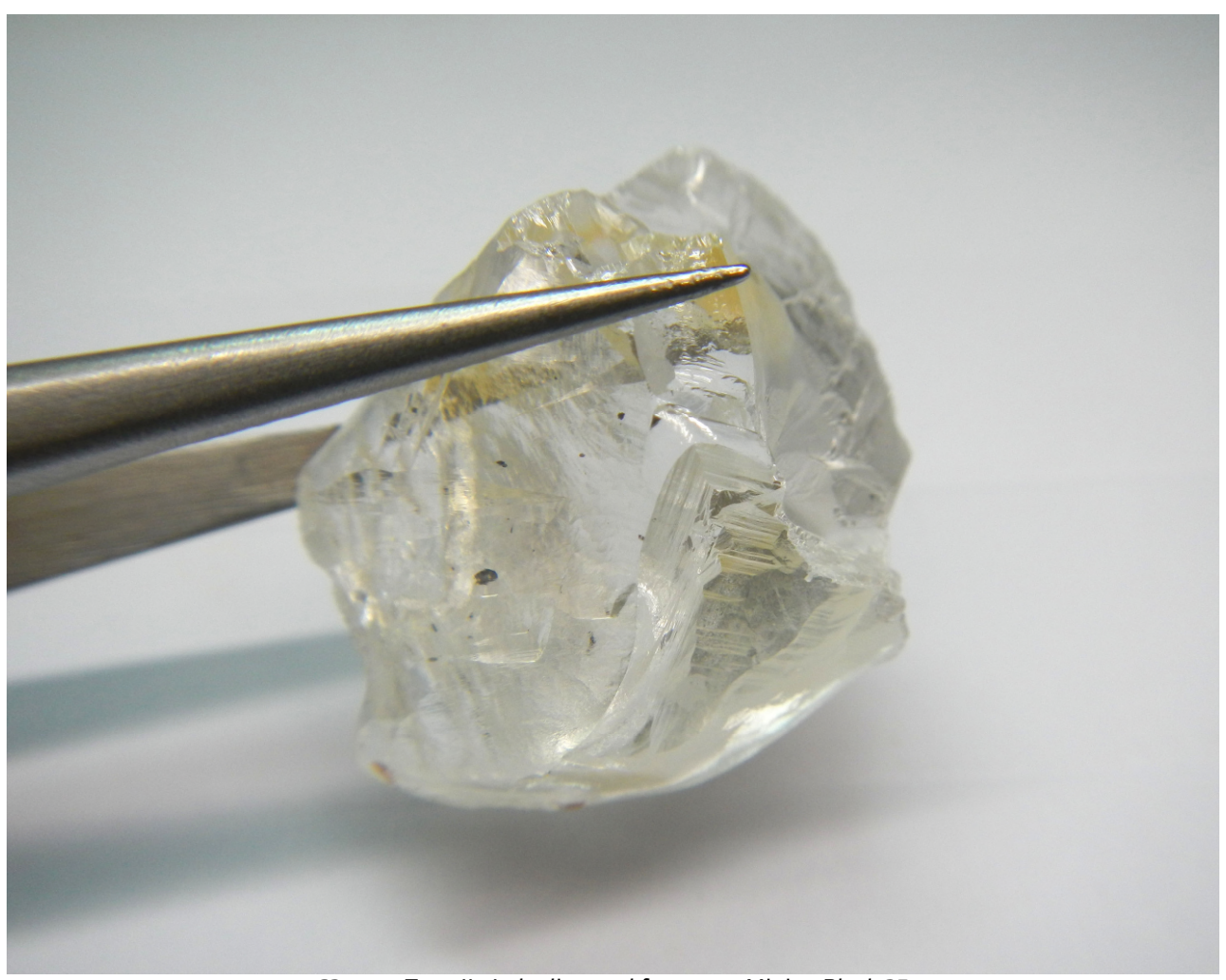
62 carat Type IIa Lulo diamond from new Mining Block 25

Testing on a Yehuda colorimeter has confirmed that the 62 carat diamond is a premium-quality Type IIa gem.