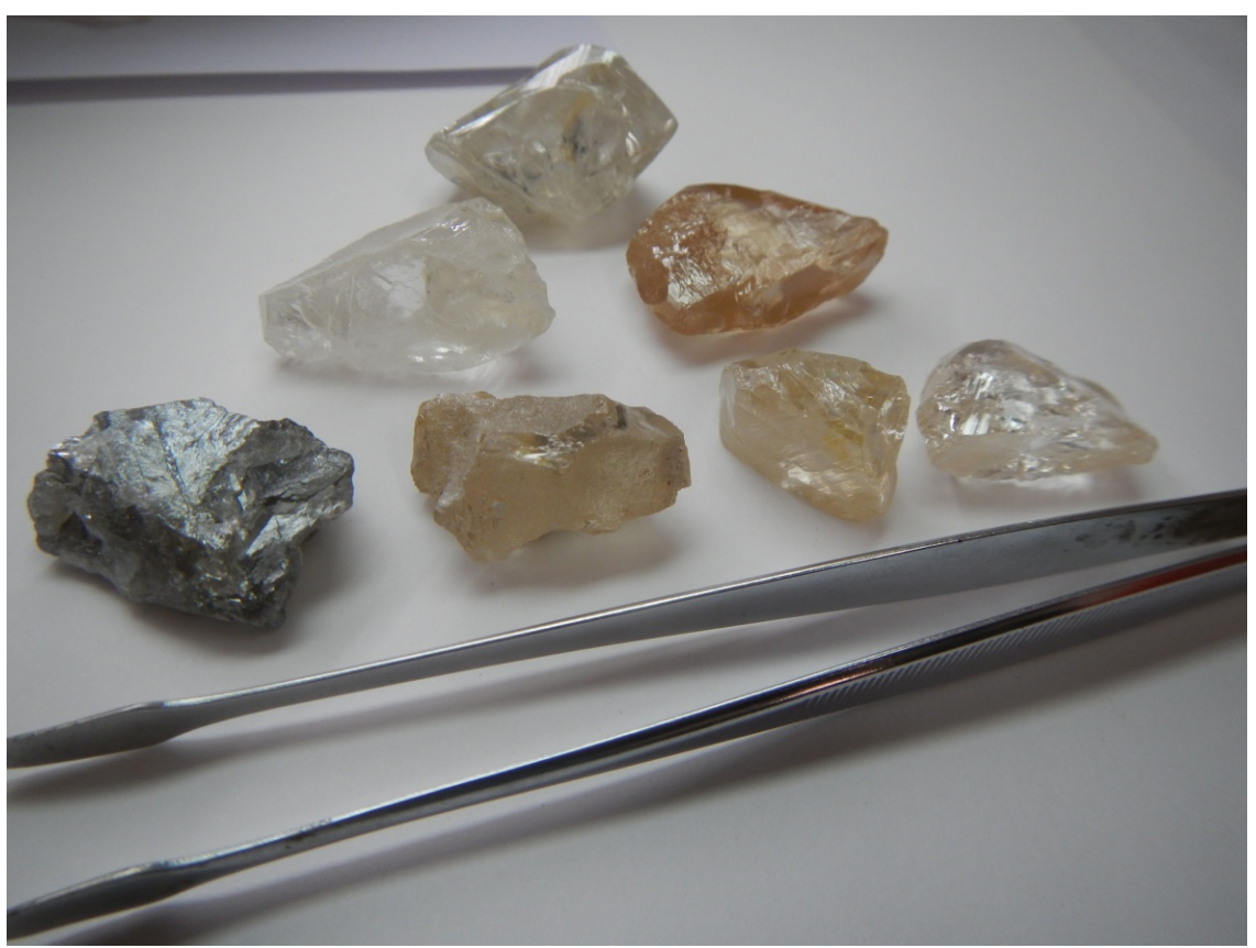
Selection of Lulo special diamonds from record July 2016 production including – 66 carats, 49 carats, 45 carats, 34 carats, 33 carats, 32 carats and 31 carats