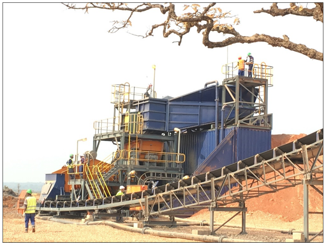
Wet front end commissioned in July 2016

"The successful commissioning of the new wet front module has also contributed to our record July results, enabling Lulo to better liberate diamonds from clay rich gravels and increase the maximum feed rate of the plant to 200 tonnes per hour."