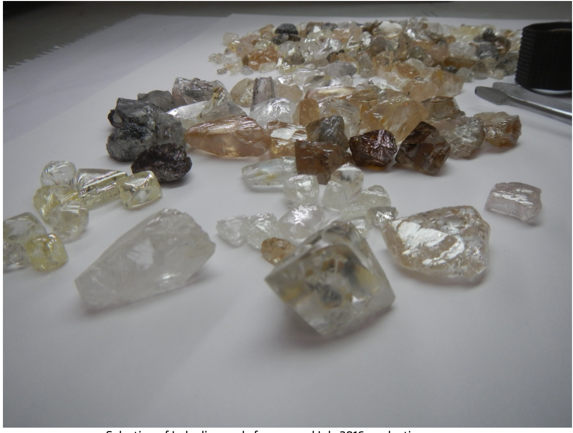
Selection of Lulo diamonds from record July 2016 production -66 carat, 49 carat and 31 carat in the foreground