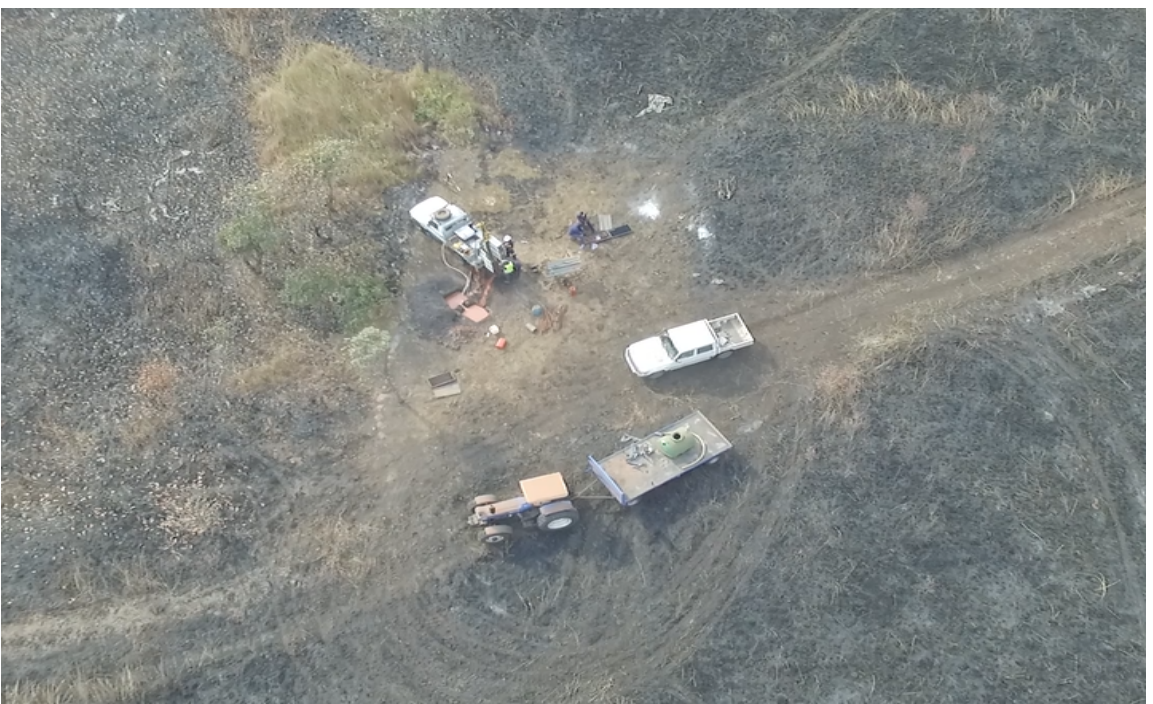
Core drilling of L259 with the mobile Sedidrill rig