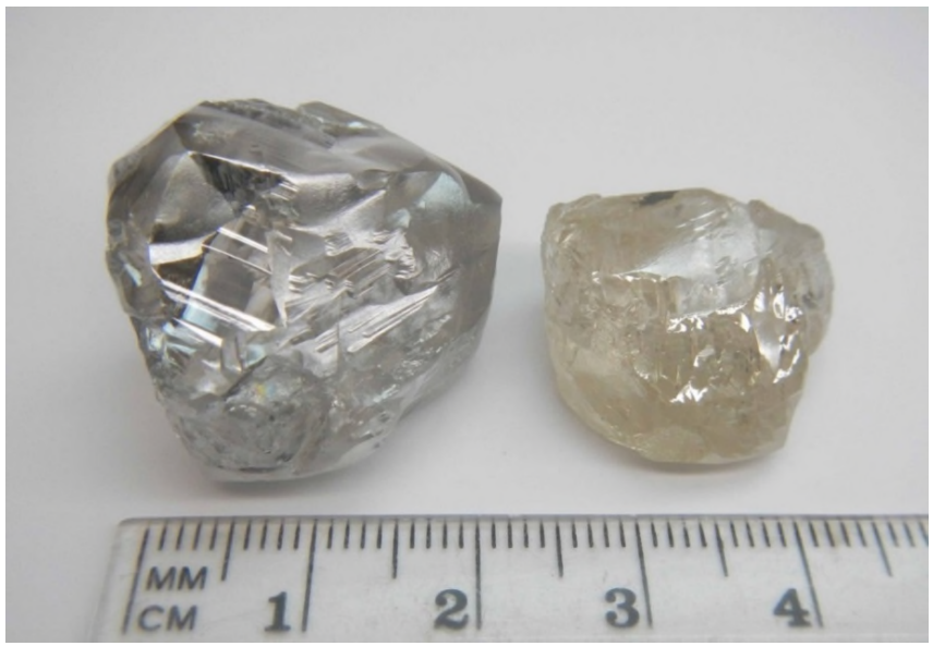
88 carat and 31 carat Type IIa diamonds recovered during the Quarter

A total of 36,753 bcm of alluvial gravels were treated through the 150 tonne per hour ("tph") diamond plant during the Quarter, representing a 113% increase in throughput compared to the previous year's quarter.