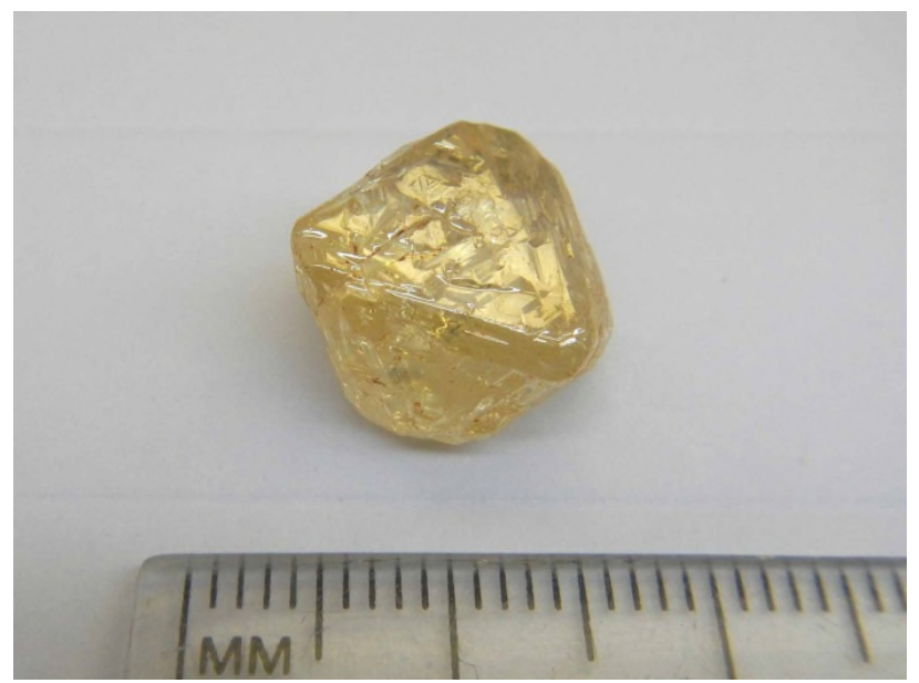
13 carat yellow diamond recovered during the Quarter

The average size of the diamonds recovered increased from 0.8 carats per stone to 1.3 carats. This increase in stone size is important considering the bottom cut off screen size in the plant of 1.5mm was unchanged.