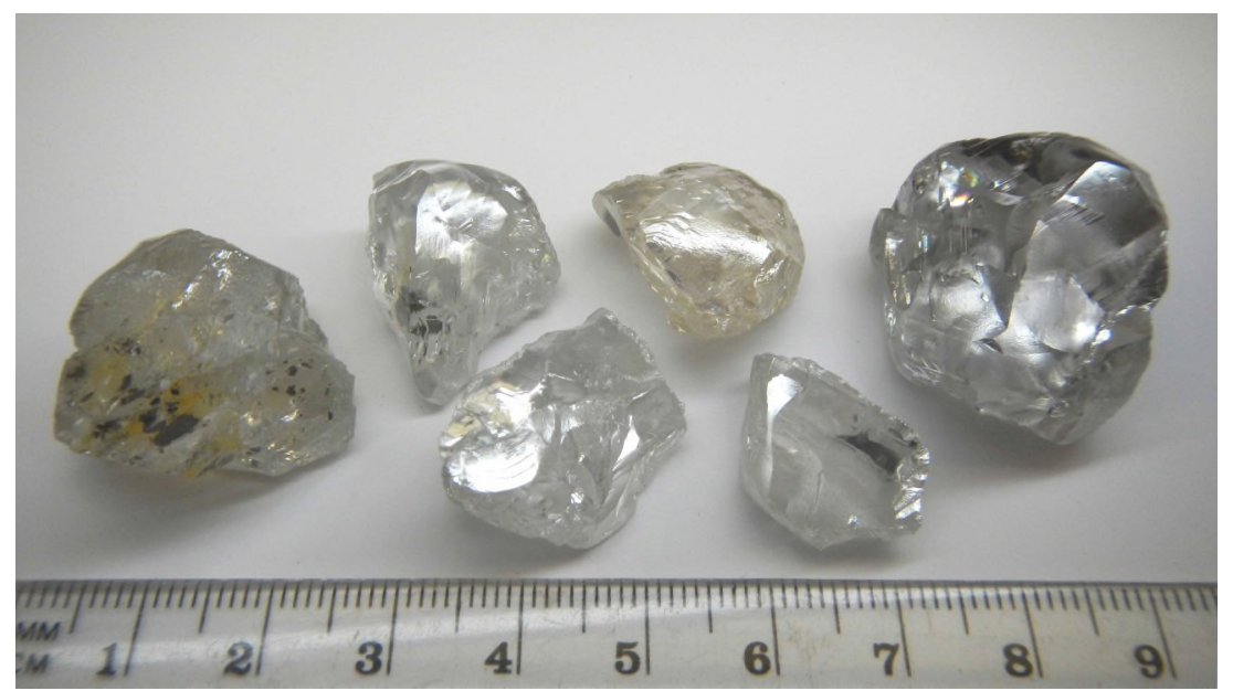
Selection of Special diamonds recovered during the Quarter

As with all previous Lulo diamond sales, the sales were conducted in Luanda by SODIAM, the Angolan Government's diamond marketing division.