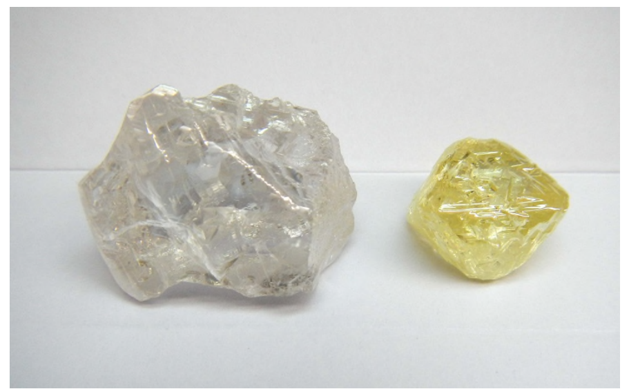
35 carat Type IIa D-colour gem and 13 carat fancy yellow in unsold diamond inventory