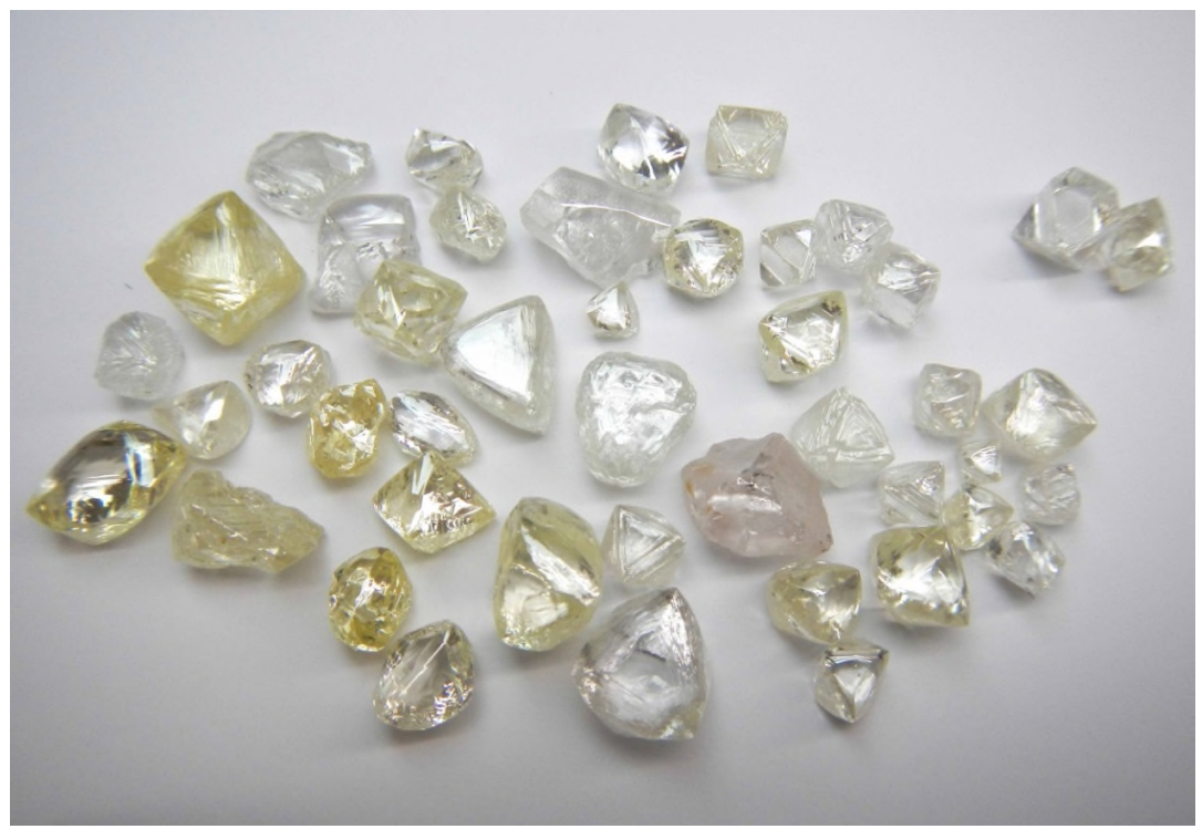
Selection of smaller diamonds recovered during the Quarter, including pinks and yellows

Lucapa and its partners, Endiama and Rosas & Petalas, are advanced in their search to identify the primary kimberlite source or sources of these exceptional alluvial diamonds, with a priority kimberlite drilling program commencing at the end of the June 2016 Quarter ("Quarter").