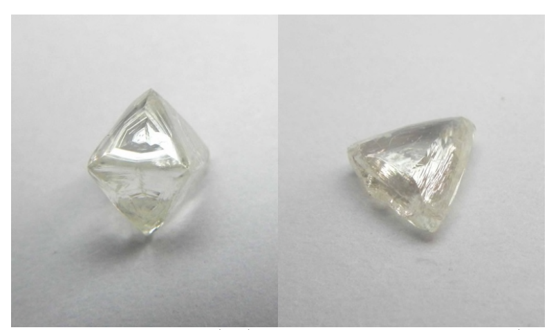
Figure 2: 0.78 carat kimberlite diamond (left) and 0.46 carat kimberlite diamond (right) from L46

E46 is also adjacent to the known diamond-bearing kimberlites L46 and L19 (Figure 1). Lucapa recovered two Type I kimberlite diamonds weighing 1.24 carats in 2015 from preliminary bulk sampling of L46 (See ASX announcement 16 October 2015) (Figure 2).