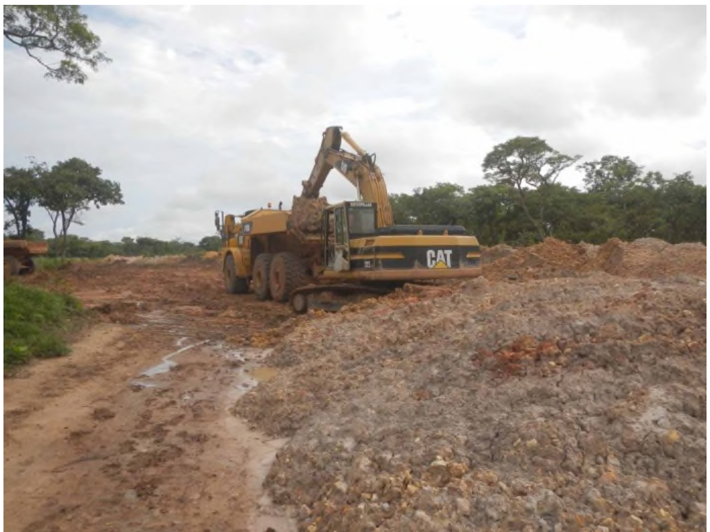
Loading of alluvial gravels from E46 stock-pile area

The E46 area has been a recent focus of Lucapa's alluvial mining activities while access to Mining Blocks 8 and 6 have been restricted due to heavy rains during the Angolan wet season. As referred to in the ASX announcement of 3 March 2016, the wet season generally finishes in April, after which diamond production from Mining Blocks 8 and 6 is scheduled to be scaled back up to the rate of 20,000 bulk cubic metres per month as ground conditions permit.