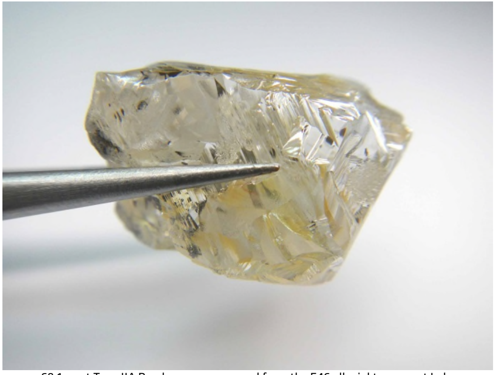
68.1 carat Type IIA D-colour gem recovered from the E46 alluvial terraces at Lulo