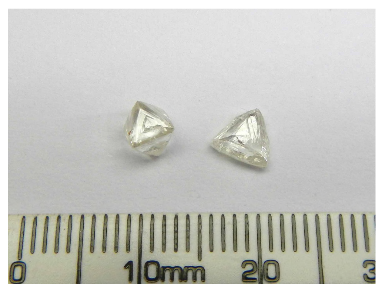
Figure 1: Diamonds recovered from the L46 kimberlite at Lulo