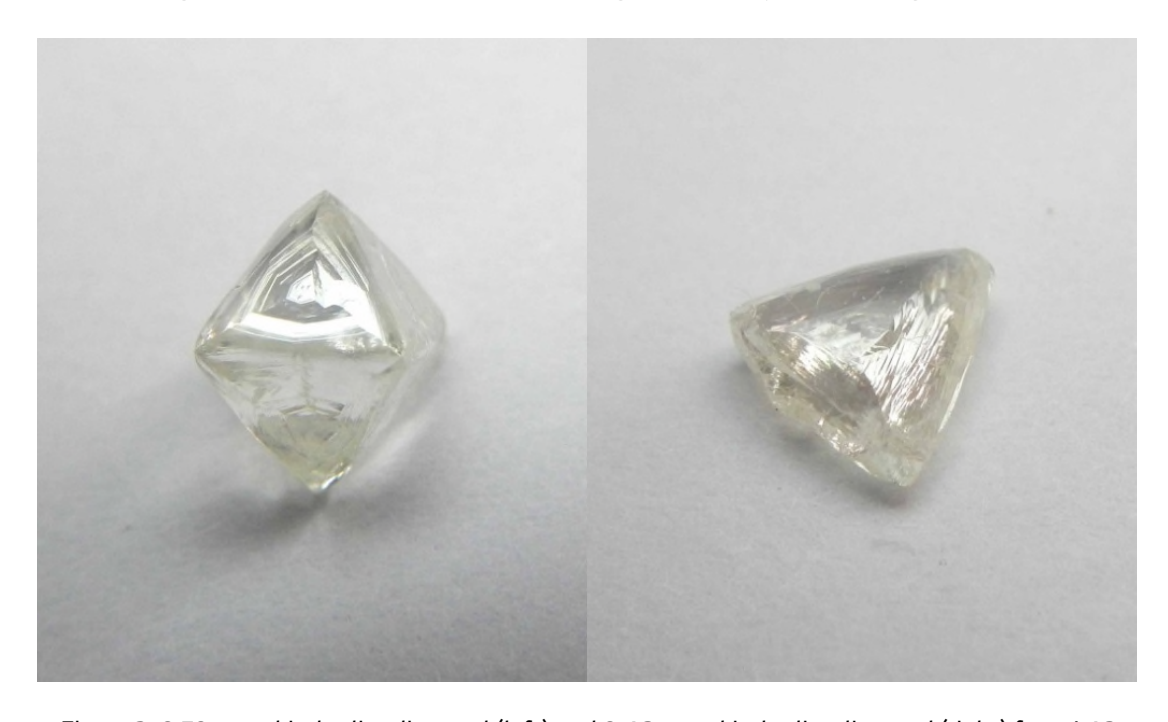
Figure 3: 0.78 carat kimberlite diamond (left) and 0.46 carat kimberlite diamond (right) from L46

Lucapa believes the L46 and L259 kimberlites could be potential sources of separate alluvial diamond fields at Lulo, being the E46 alluvial terraces and Mining Block 8 respectively (Figure 2).