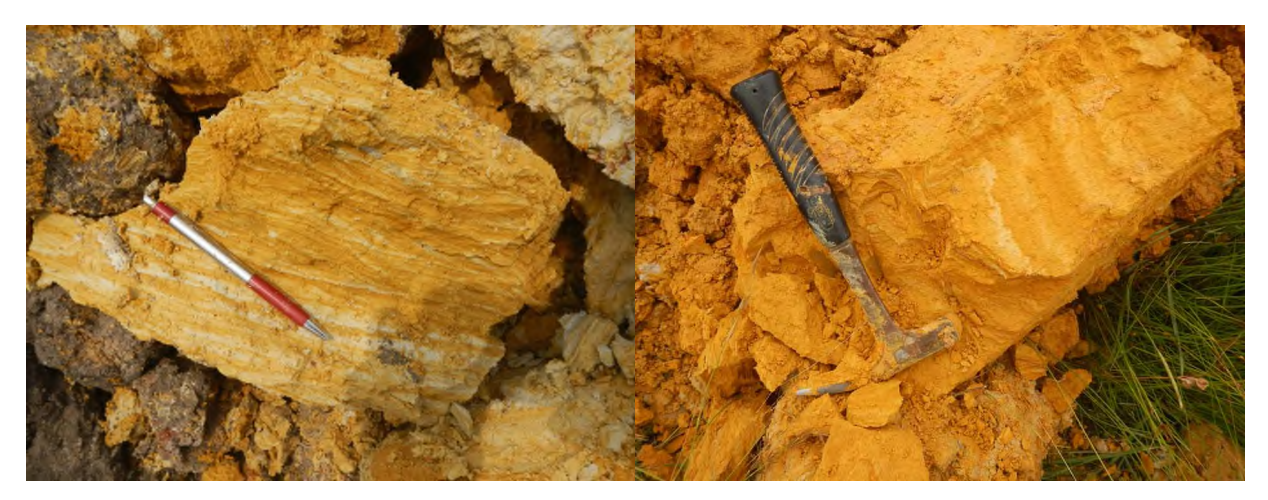
Figure 4: Re-worked crater-like sediment – finely-bedded lacustrine sediment

In addition, re-worked crater like sediment or transported RVK (or SRVK) material (Figure 4) was intersected in 17 southerly gravel pits (Figure 1 – yellow circles) between Mining Block 8 and kimberlite L259, indicating a proximal kimberlite.