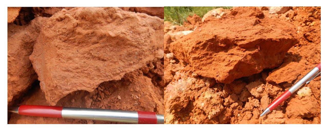
Figure 3: In-situ RVK material recovered from pits adjacent to the expanded Mining Block 8

As foreshadowed in the ASX update of 25 September 2015, the first aim of this program was to confirm the presence of kimberlite material and thus upgrade the kimberlite target to a confirmed kimberlite.