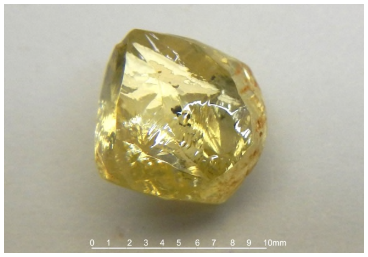
5.15 carat fancy vivid yellow Lulo diamond recovered in the June Quarter

Mining is now set to resume at BLK_08 following an improvement in ground conditions and the arrival on site at Lulo of a new fleet of Caterpillar earth moving equipment (See New Caterpillar Equipment Fleet section below). Mining in higher-grade areas such as BLK_08 is expected to lead to an increase in diamond grades and average stone size in the September 2015 quarter.