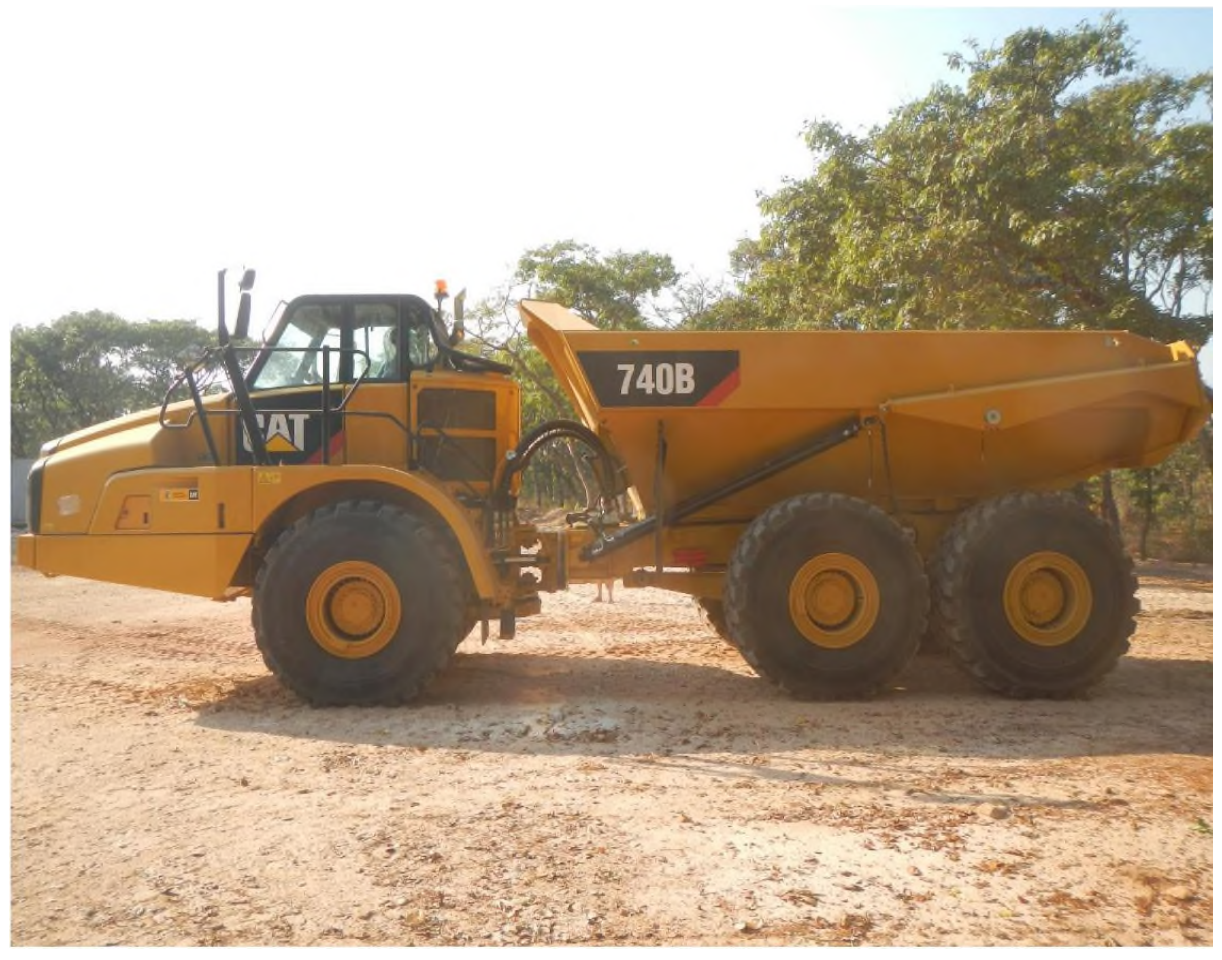
CAT 740B dump truck - part of the new Caterpillar fleet which has all been delivered to Lulo

Securing the new fleet will enable Lucapa and its partners to double alluvial diamond production to 20,000bcm/month, thereby accelerating the generation of operational cash flows earlier than originally planned. Lucapa expects to be operating at the new 20,000bcm/month target rate by the end of the September 2015 quarter.