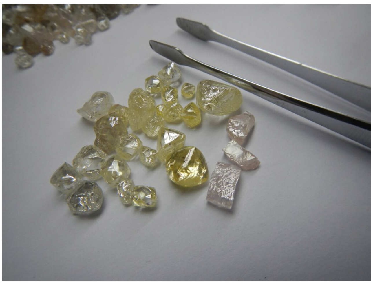
Select fancy coloured diamonds from June Quarter production at Lulo to be sold in the next sale, scheduled for later in third quarter 2015

The current unsold inventory of Lulo diamonds stands at more than 1,600 carats.