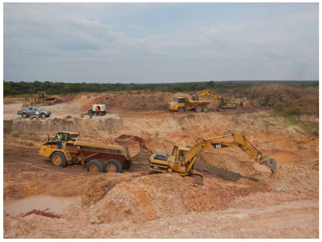
Alluvial diamond mining operations at Lulo during the June Quarter

Significant advancements have also been made to locate the sources of these exceptional alluvial diamonds within the concession. Lucapa and its partners have identified 296 kimberlite targets at Lulo, of which 96 have so far been classified as proven or probable kimberlites and four confirmed as diamond-bearing pipes.