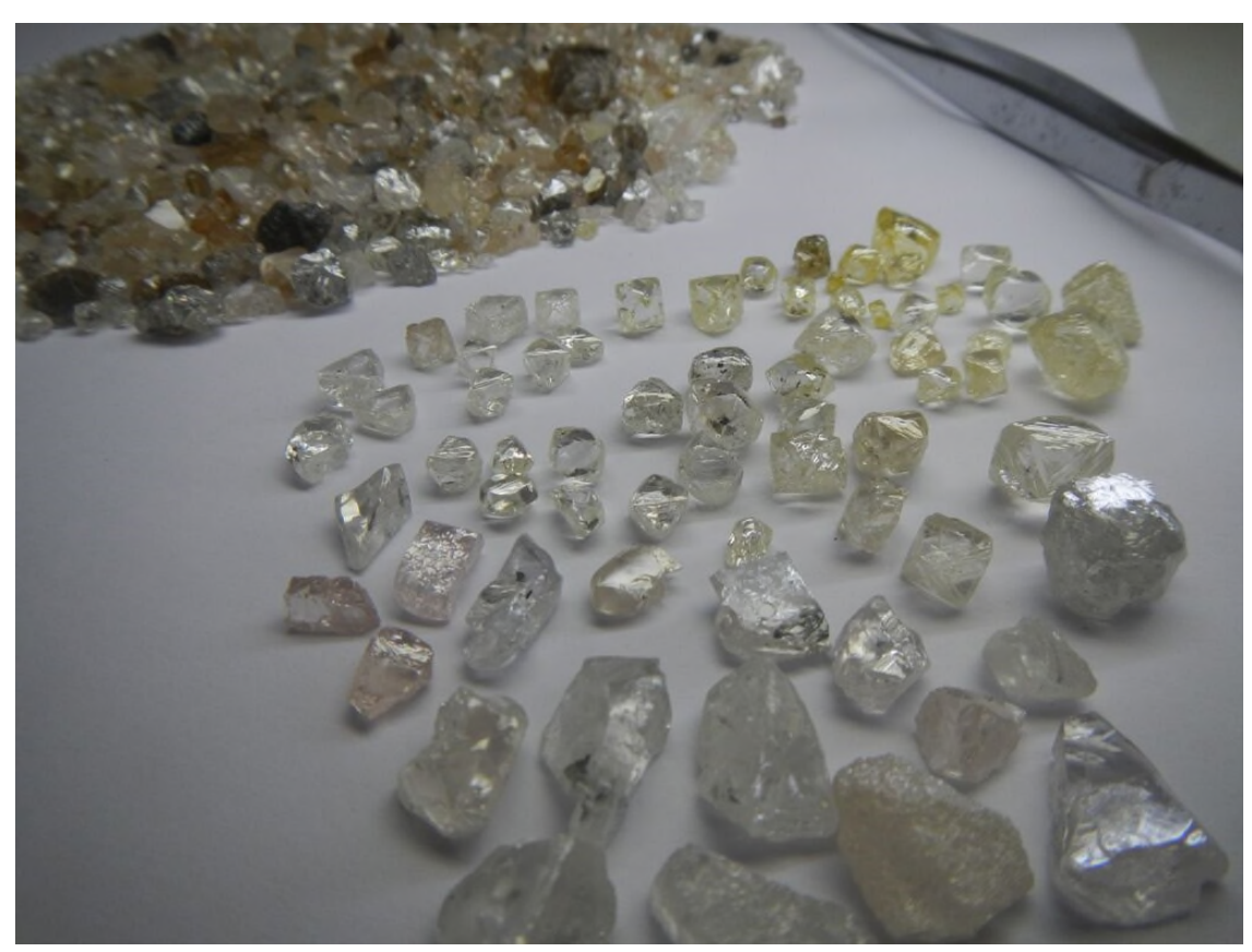
Lulo diamonds in inventory for next diamond sale