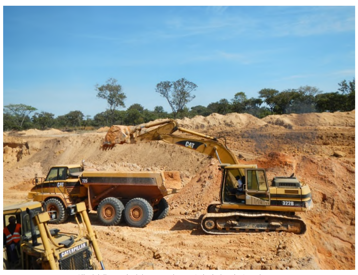
Alluvial diamond mining operations at Lulo during the June Quarter

The second factor was the trucking distances between the 150tph diamond plant and BLK_08 mining area – the area which produced high-grade and quality diamonds during the initial bulk sampling phases at Lulo. These haulage distances, coupled with soft ground conditions, resulted in increased wear on the earth moving equipment as well as increased dilution of gravels from BLK_08. This prompted the decision in late May to return to mining area 31 and a lower-grade mining area 22 which are closer to the diamond processing plant in order to achieve the Phase 1 target of 10,000bcm/month.