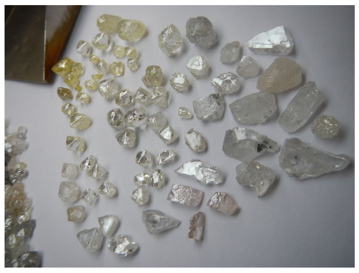
Lulo diamonds mined during the June Quarter in the diamond inventory

A total of 1,818 diamonds were recovered in the June Quarter weighing 1,430 carats for an average stone size of 0.8 carats. These recoveries included 3 diamonds > 10.8ct with the 63.05ct D-colour white Type IIa being the largest diamond recovered and sold during the period. The reduction in average stone size was a direct result of the move to mining area 22.