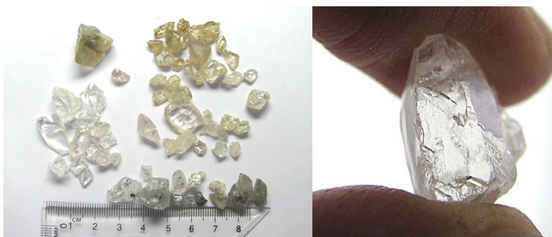
Lulo diamonds from the 385.4 carat parcel, including the 10.15 carat gem

The parcel of Lulo diamonds to be sold is expected to exceed 1,000 carats. This will include a parcel of 385.4 carats which was previously valued US$1,239 per carat (See ASX announcement 30 October 2014).