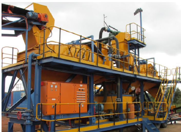
Lucapa's 150 tonne per hour diamond treatment plant at Lulo