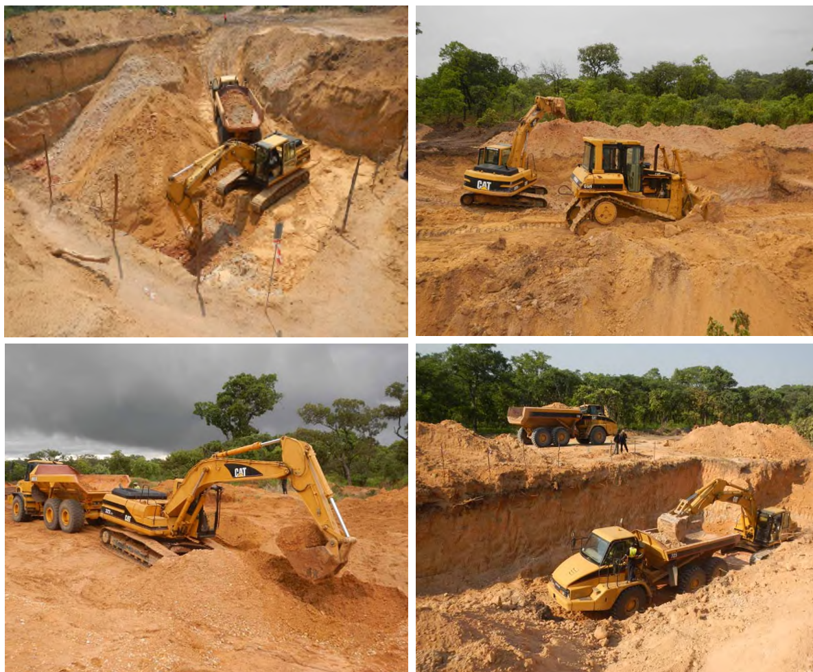
Bulk sampling operations at Lulo