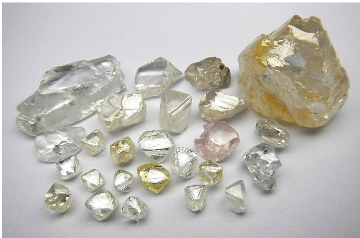
Lulo diamonds included in 371.35 carat parcel approved for sale

The 371.35 carat valuation package will be the second parcel of Lulo diamonds to be sold. As announced on 31 July 2013, Lucapa sold its first parcel of Lulo diamonds, weighing 496.2 carats, for gross proceeds of $3.12 million, from which Lucapa received net proceeds of $2.7 million.