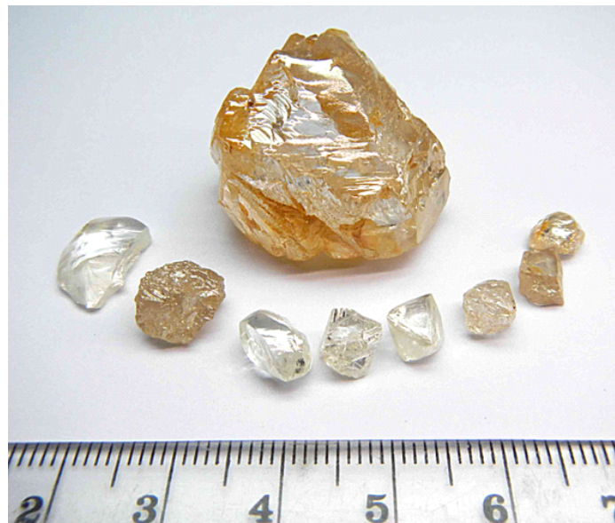
Recent diamonds recovered from BLK_19. The individual diamonds shown weigh 95.45, 3.35, 3.90, 2.55, 1.75, 1.75, 1.45, 1.20 and 1.05 carats

The 95.45 carat diamond is an exceptional stone. It has an irregular, roughly equant shape and measures 25x20x16mm. It was assessed using a Yehuda ZVI colorimeter and confirmed as a Type 2A, which are among the world's rarest category of diamonds.