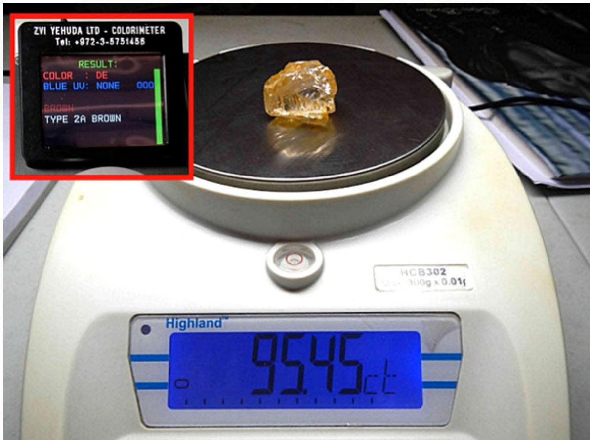
95.45 carat Type 2A diamond on scale with Colorimeter result inserted

The BLK_18 commissioning sample is located within the northern part of the Lucapa’s priority Se251 kimberlite pipe at Lulo (Figure 1). The BLK_19 bulk sample is located adjacent to the old BLK_6 site, approximately 1,600 metres south-east of Se251 (Figure 1).