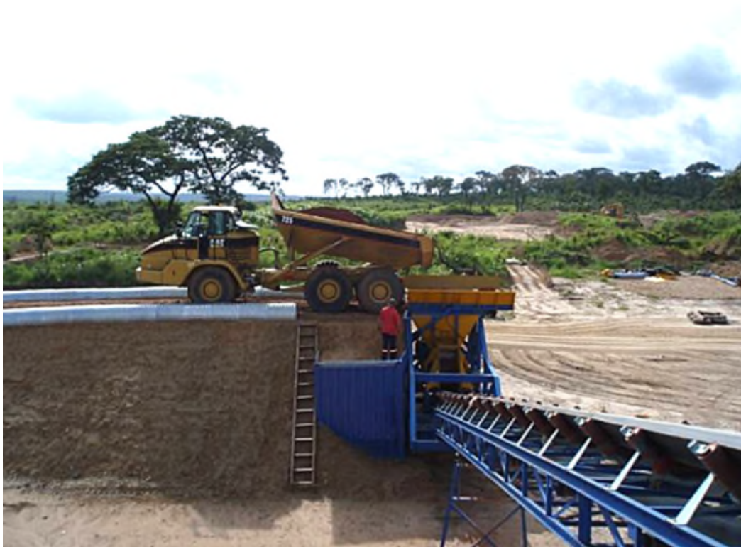
Feeding BLK_19 into the feed hopper of the new DMS plant

As announced on 3 January 2014, Lucapa commenced processing the BLK_19 bulk sample to enable the Company to directly compare treatment results and metallurgical parameters for gravel treated through the old and new DMS plants (See Table 1). While the diamond size distribution in the two samples differs significantly, this is not unexpected given the very large size of some of the diamonds recovered from each sample.