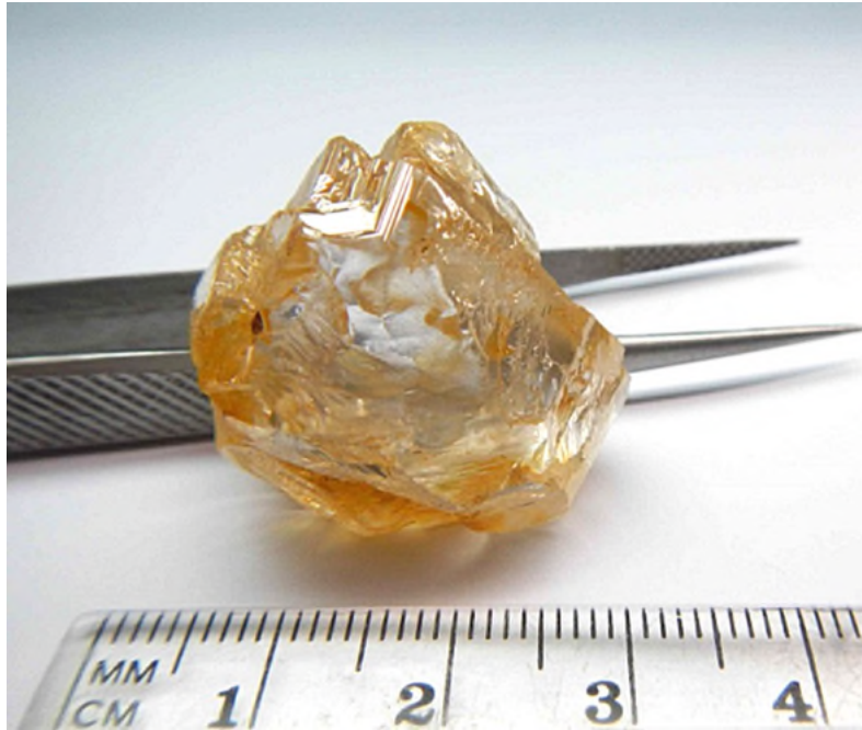
95.45 carat Type 2A diamond recovered from the Lulo Diamond Concession (Yet to be acid washed)

Currently, the colour is classified as DE, which would normally make the diamond an “Exceptional White.” However, the colorimeter also describes the stone as brown. Cleaning the diamond and re-testing it with the colorimeter should resolve the classification.