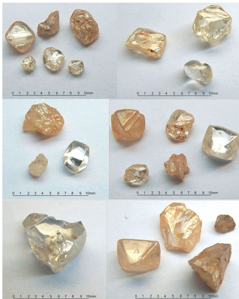
Diamonds from BLK_18 – the largest stone shown (bottom left) weighs 3.7ct

Since the Company last reported the results from the BLK_18 bulk sample on 3 January 2014 an additional 410 cubic metres of gravel has been processed and an additional 32 diamonds weighing 25.35 carats has been recovered. As of 10 January 2014, a total of 1,145 cubic metres of sample processed from BLK_18 has produced 75 diamonds weighing 55.05 carats . The diamonds recently recovered included individual stones weighing 5.30, 4.35 and 2.00 carats.