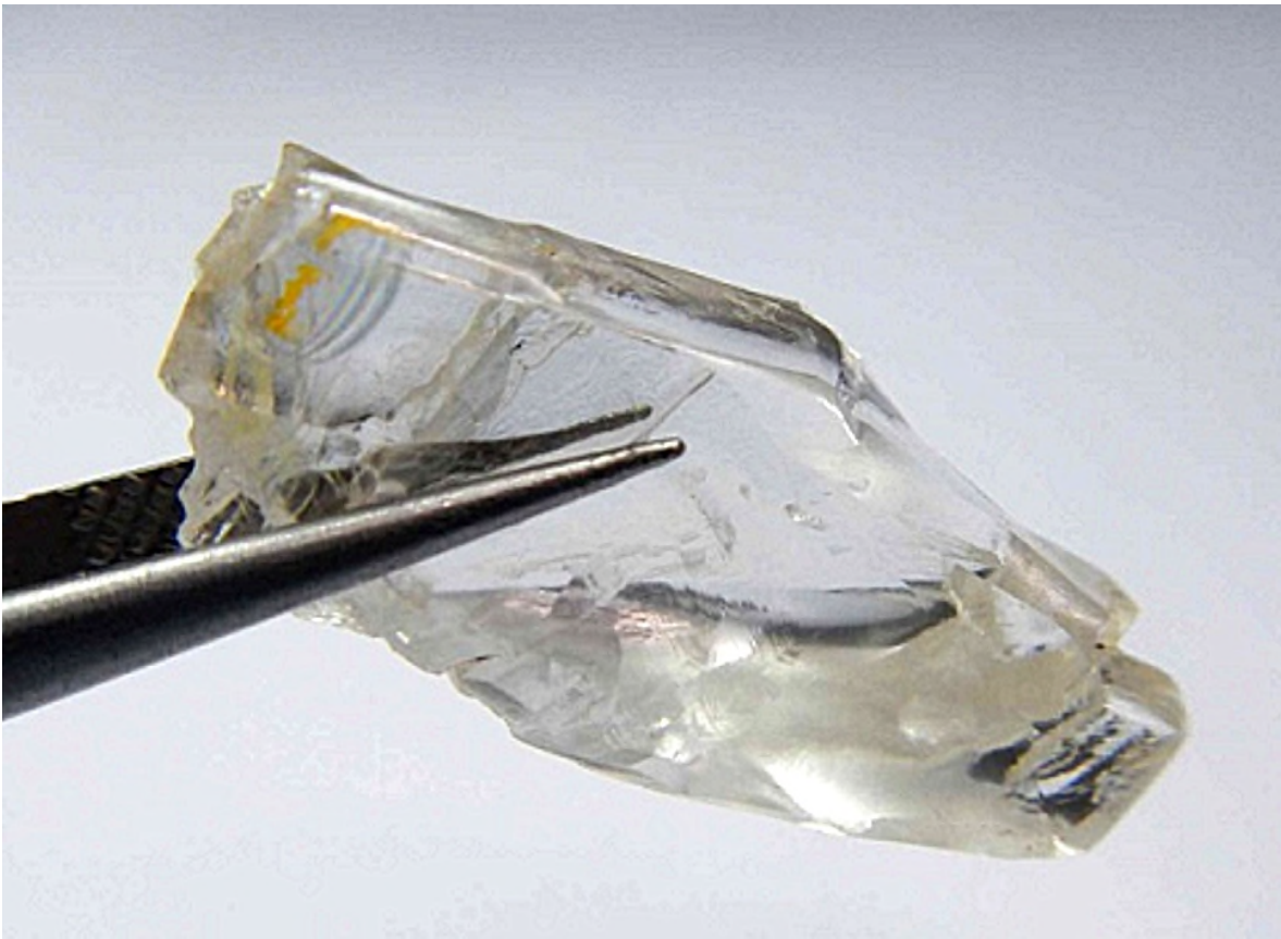
32.2 carat Type 2A diamond from BLK_19

“We are continuing to recover large, rare Type 2A diamonds from multiple and widespread pits within our 3,000 square kilometre Lulo project and are confident of finding the kimberlite pipe or pipes, that are the source of these magnificent diamonds” said Mr Kennedy.