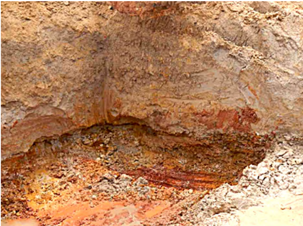
Bulk sample BLK_19