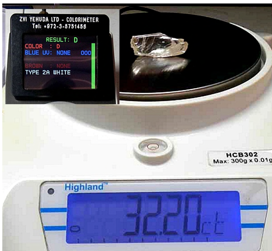
32.2 carat Type 2A diamond from Lulo

Lucapa began processing the BLK_19 bulk sample to directly compare treatment results and metallurgical parameters for gravel treated through the old and new DMS plants. The BLK_19 pit abuts and extends the BLK_06 pit and the gravels from the two samples were considered essentially identical in character.