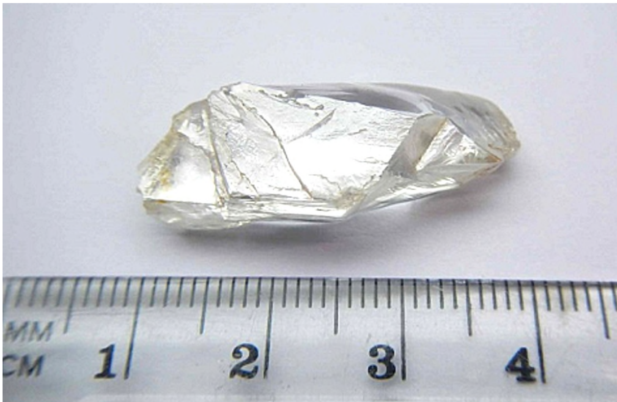
32.2 carat Type 2A diamond from Lulo

The diamond measured 32x10x8mm and is the largest recovered by Lucapa through the new Dense Media Separation (DMS) plant which the Company commissioned in November 2013 and is the fourth largest diamond recovered at Lulo to date.