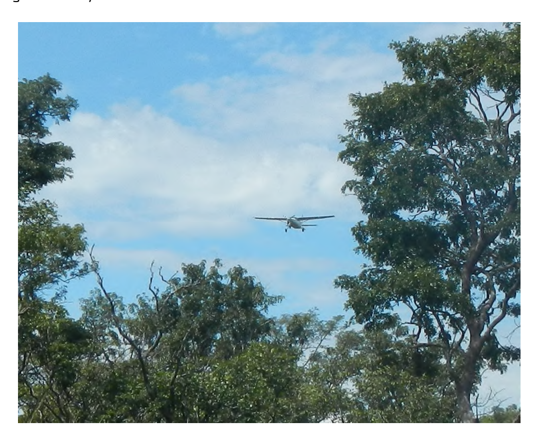
Fugro Airborne Surveys flying the aeromagnetic survey over Lulo

The Company hopes to complete a review of its priority kimberlite targets once the magnetic data from the aeromagnetic survey becomes available in the next few weeks.