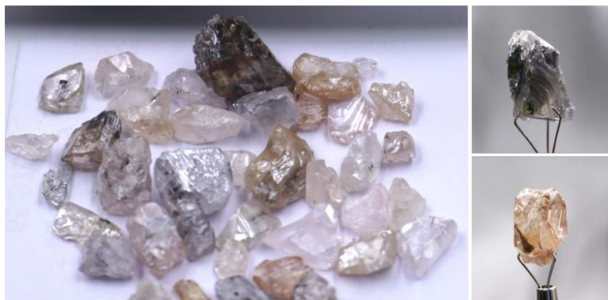
Photos: Diamonds recovered from kimberlite L164 bulk sample – <10.8 carat diamonds (left) and two Specials weighing 15.27 carats and 12.37 carats (right)

This yielded an average grade of ~3.00 carats per one hundred cubic metres (“cphm 3 ”) or ~1.17 carats per one hundred tonnes (“cpht”) and an average stone size of ~1.61 carats (at a bottom cut of screen size of 1.5mm).