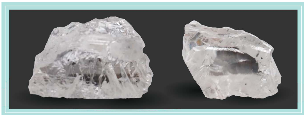
First two +100 carat recoveries at MB46 - 113 carat (left) and 104 carat (right) Type IIa D-colour white diamonds 1

The frequency of recovery of these high-value +100 carat stones from MB46, highlights the prospectivity of the Canguige catchment and adjacent priority kimberlites (Figure 1). To date, MB46 has averaged one +100 carat diamond recovered for every ~33,000 bcm’s of gravel processed. This is the best occurrence rate for any block mined to date at Lulo, including the prolific MB08.