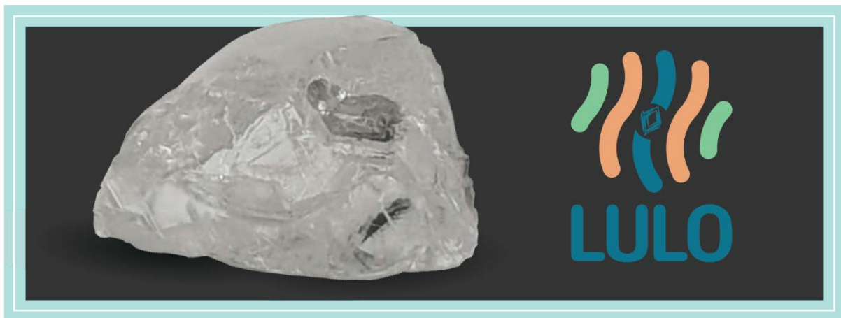
114 carat Type IIa white diamond recovered by SML at MB46

The 114 carat Type IIa D-colour white diamond is the third +100 carat diamond recovered from Mining Block 46 (“MB46”) in the last eight weeks 1 .