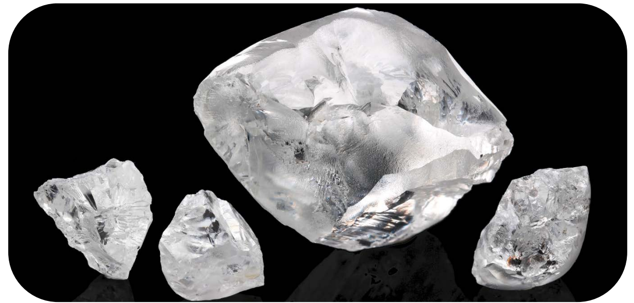
Select D colour Special diamonds - (from left) 14 carat, 19 carat, 101 carat and 28 carat diamonds

The 101 carat D-colour gem recovered is the 4<sup>th</sup> +100 carat diamond recovered since commercial production commenced in January 2019. This is Mothae's most valuable diamond ever recovered.