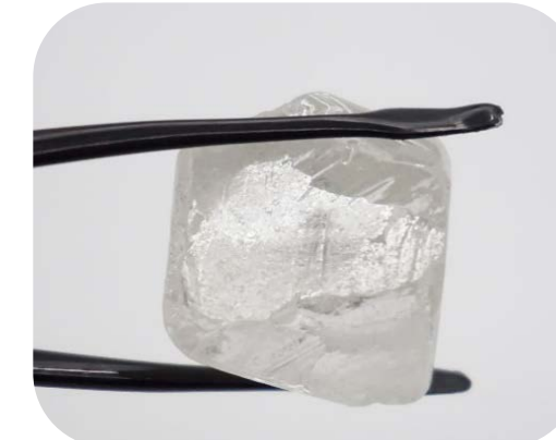
127 carat white Lulo diamond recovered from MB24 leziria

The recoveries of large and high-value stones continued from the Lulo Mining Blocks ("MB") during the Quarter with the recovery of two more +100 carat diamonds - a 127 carat gem-quality stone from the leziria area of MB24 and a 113 carat gem-quality stone from the terraces at MB46.