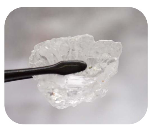
113 carat white Lulo diamond recovered from MB46 terrace