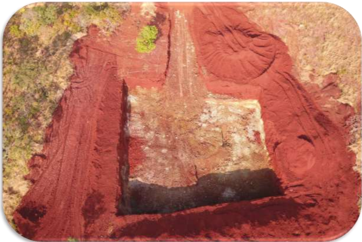
Lulo bulk sample excavation at L028 kimberlite during H1 2021