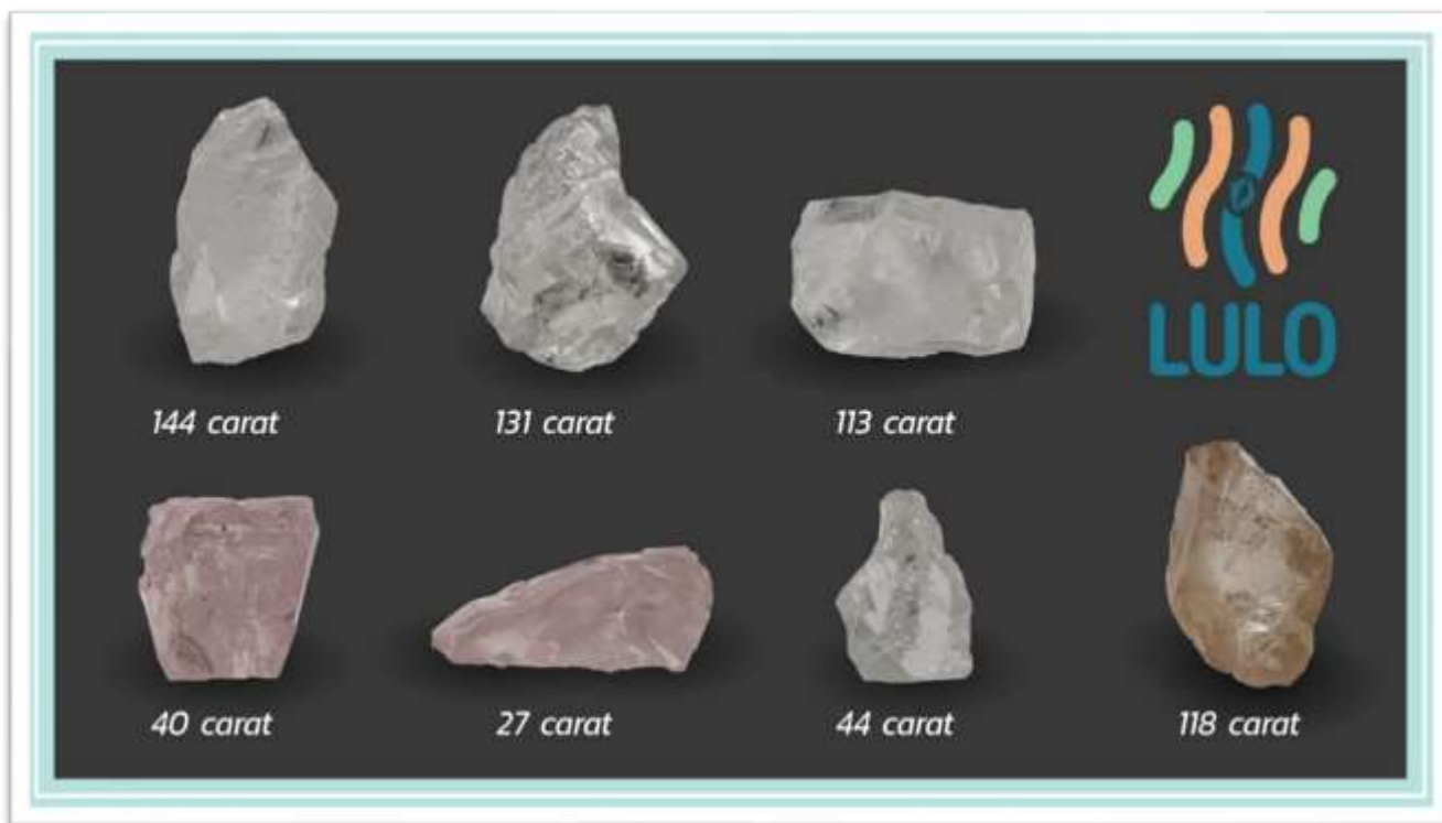
Lulo Special diamonds sold on tender during the first half 2021