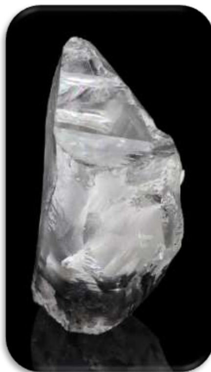
Selection of Mothae Special Type Ila D-colour diamonds recovered in H1 2021 (215 carat (left), 88 carat (right))