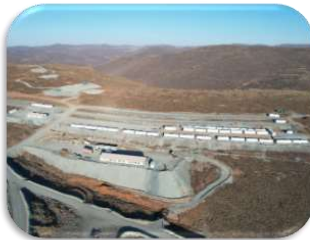
Newly expanded Mothae processing plant (left) and relocated camp and mine offices (right)