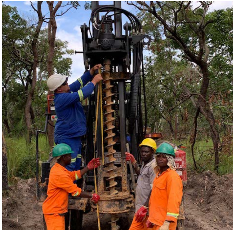
Resource-definition auger drilling at Lulo

Alluvial mining at Lulo is conducted by Sociedade Mineira Do Lulo (Lucapa 40% associate and operator).