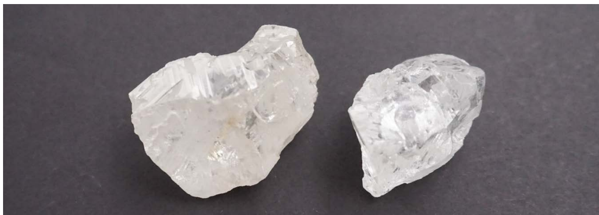
84 carat Lulo gem (right) recovered during the Quarter and 117 carat gem (left) recovered post-Quarter

The full fleet of new earthmoving equipment was operational at Lulo throughout the Quarter. This new Volvo and Caterpillar fleet – comprising six excavators, eight trucks, two tracked dozers and a wheel dozer – is part of a US$12m SML-funded expansion of the alluvial mining operations which is planned to deliver a ~50% increase in carat production in 2020 (Refer Group diamond production growth section).