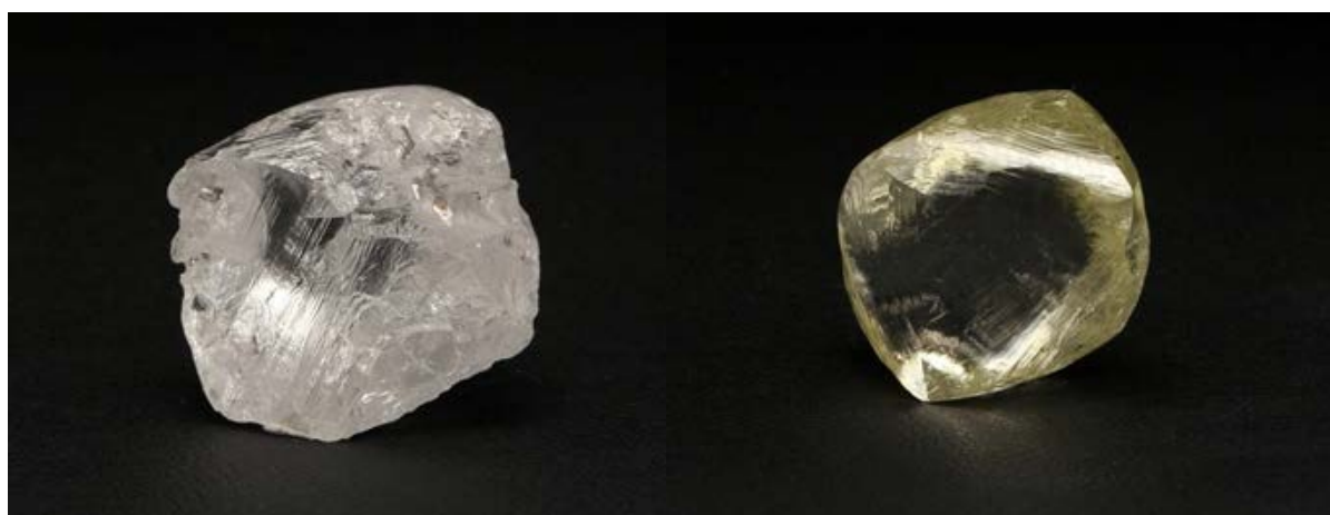
Gem-quality Mothae diamonds sold during the Quarter – 25 carat white and 22 carat yellow