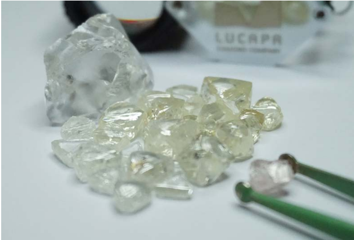
Selection of Lulo diamonds sold during the Quarter