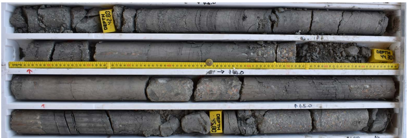
Drill core from Little Spring Creek prospect at Brooking

Brooking is located ~40km of the Ellendale diamond mine which, when in operation, was the world's leading producer of rare fancy yellow diamonds.