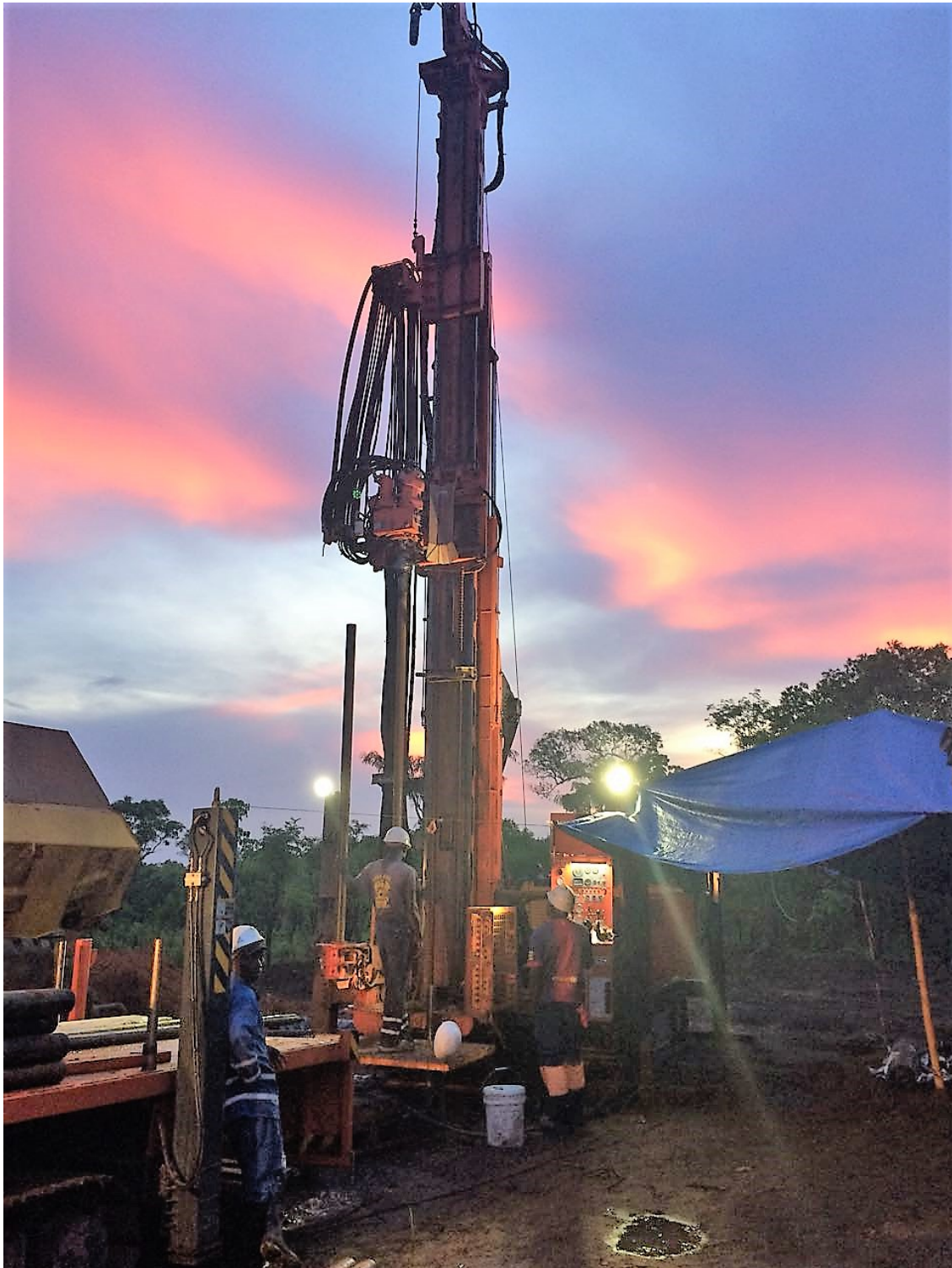
Kimberlite drilling at Lulo