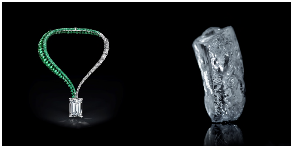
The Art of de Grisogono necklace featuring the giant 163 carat Type IIa D flawless diamond cut and polished from the 404 carat Type IIa D colour Lulo gem

The spectacular 163 carat Lulo diamond took 11 months to cut and polish and is featured in a necklace designed by de Grisogono. It will be auctioned in Geneva in November 2017 after also being showcased in London, Dubai and New York.