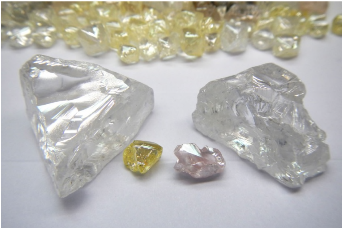
Selected Lulo diamonds recovered during the Quarter including Type IIa gems weighing 83 carats and 58 carats and fancy yellow and fancy pink gems

Lulo, through mining company SML, generates strong cash flows mining large and premium-value alluvial diamonds. Lulo has produced Angola’s two largest diamonds on record, weighing 404 carats and 227 carats.