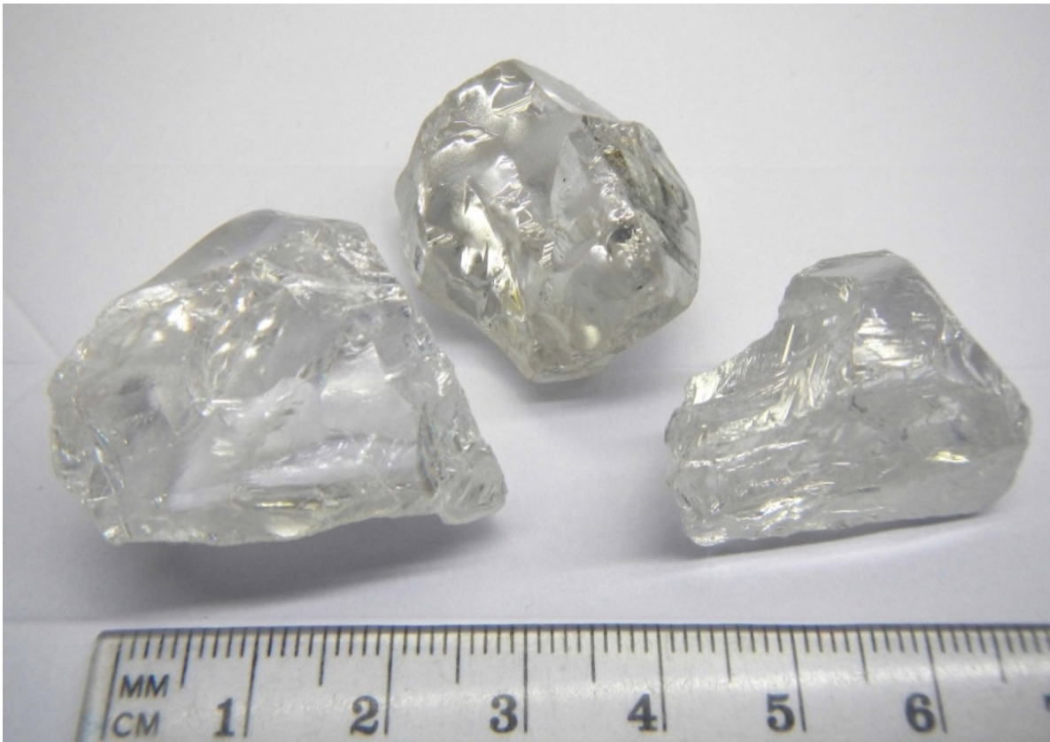
Type IIa Lulo diamonds recovered during the Quarter weighing 83 carats, 68 carats and 58 carats

Lulo continued to regularly produce large and premium-value diamonds throughout the Quarter, including 68 Specials weighing a total of 1,925 carats. These Specials included two 83 carat diamonds and eight other +50 carat stones.