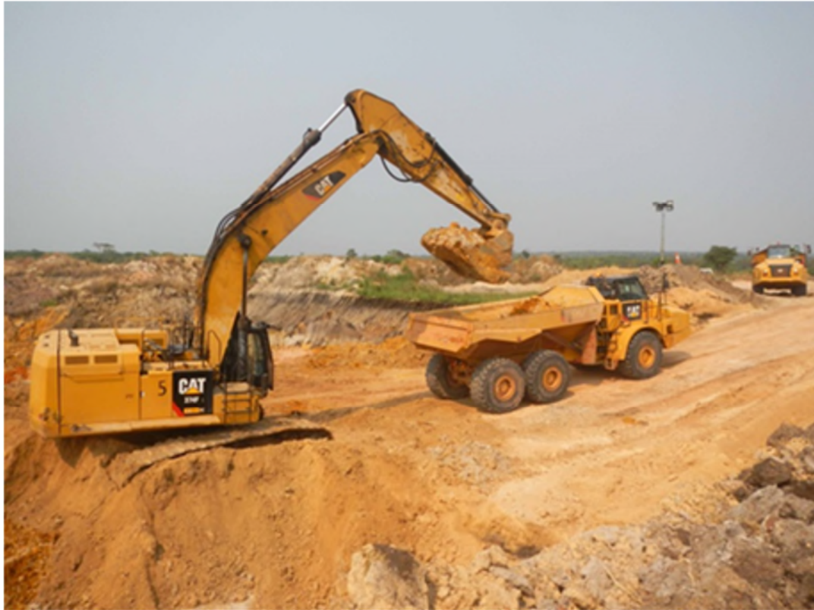
Diamond mining activities at Mining Block 8 during the Quarter

Despite production during the Quarter being adversely impacted by maintenance downtime with certain of the Lulo earth moving fleet, the 60,000 bcm target was achieved. The breakdowns on the excavators have since been fixed and mining is now running ahead of plant processing at Lulo.