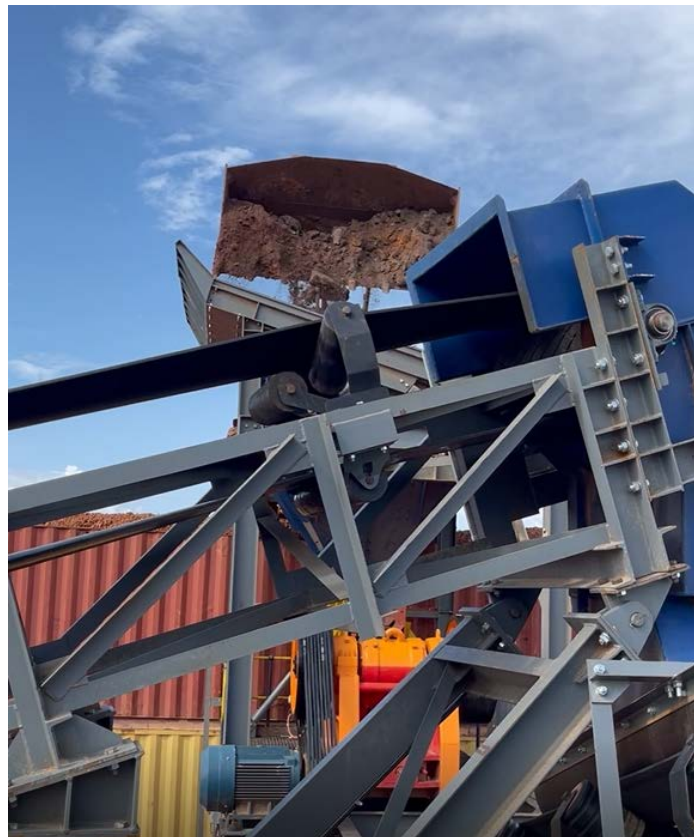
Photo 1: Test feeding kimberlite material through completed feed bin and crushing circuit

The key objective of this kimberlite bulk sampling program is to identify the primary source pipe(s) of the exceptional large and high-value diamonds being recovered in the alluvial mining operations and to assist in a preliminary economic assessment of the potential source discoveries.