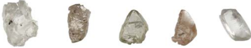
Photo 2: (from left to right): 0.93, 0.59, 0.49, 0.41 and 0.30 carat diamonds recovered from L028 kimberlite bulk sample

The L028 bulk sample result was an important outcome for the kimberlite exploration program in the Canguige catchment because it is the rare Type IIa content that allows Lulo to attract some of the highest average prices per carat for alluvial diamonds on the Lulo concession (refer ASX announcement 8 November 2021).